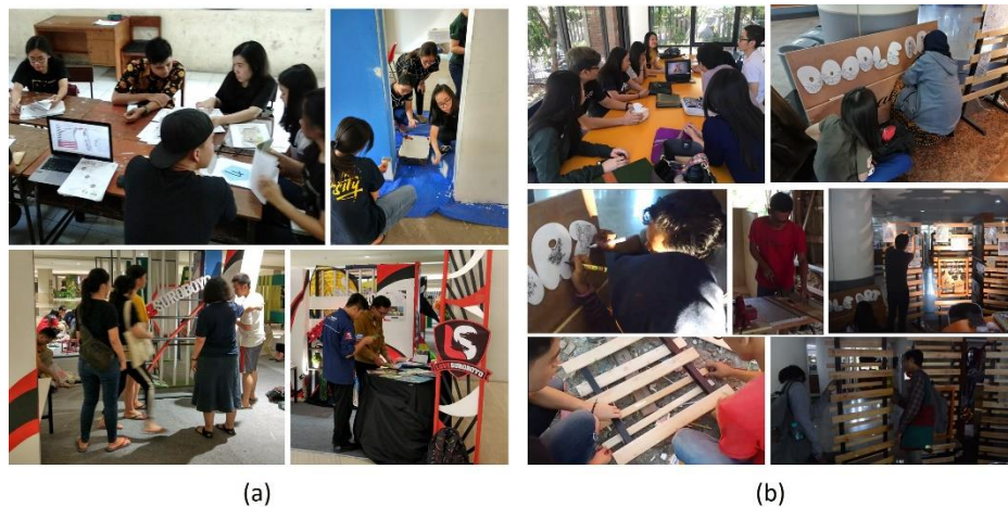
Figure 5. Participatory and co-design design process of planning, building, and setting of exhibition booth in malls and public halls for the (a) Love Suroboyo Community, (b) Doodle Art Surabaya Community (Source: Author, 2019).

Entering the Prototype stage, the designers actualize a part of the conceptual ideas from the Ideate stage, by building a set of exhibition facilities that can be used by the community during exhibition events in public spaces. Building the booth was done through a collaborative process of planning, finding materials, constructing, transporting and assembling (Figure 5).