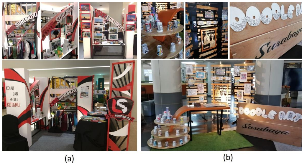
Figure 6. Results of exhibition facilities for the (a) Love Suroboyo Community, (b) Doodle Art Surabaya Community, constructed through the participatory and co-design process. The booth can grant opportunities for startup groups to display their skills to the public.

creative startup groups from the community can exhibit themselves and their skills to the wider community. Since the display booths were designed in part to be portable, they can be reused over and again in other events, functioning as a sustainable mode of promotion.