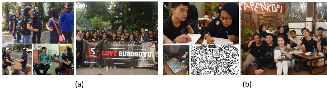
Figure 2. An emphatic and ethnographic field observation process was conducted through the participation of designers in the creative community's routine events and activities.

doodle merchandise which they sell during markets and exhibition events. Both communities are strongly active communities that have the potentials to form startups in the creative economic wave and the skills that can contribute to the local identity and social as well as touristic development of Surabaya city.