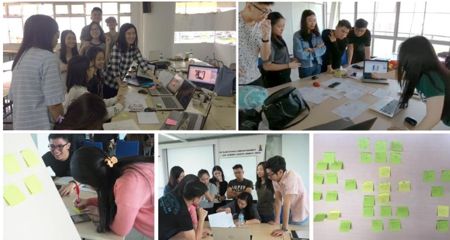
Figure 3. The contextual and participatory design process of defining design goals that are based on FGDs, affinity graphics and community input

Entering the Ideate stage, the designers produced various concepts for the design of a community center for each community. They based their concepts on the community's character, aspirations, and content of exposition that they collaboratively acquired from the Define stage. For the Love Suroboyo Community, the goal was to create a community space that could highlight the icons and image of Surabaya city, often captured by their photographic and journalistic works. The conceptual design produced was based on Surabaya's famous Red Bridge (Figure 4a), a historical site of the huge battle that happened between the Indonesian army and the West after their struggle for independence, the event from which Surabaya gained the epithet as the "city of heroes." The community center was designed with high considerations to how journalists and photographers work together with photo studios and collaborative spaces that were fused with the walls, floors, and ceilings. They adopted patterns and images of Surabaya landmarks, such as the Suro (shark) and Boyo (crocodile), statue, symbolizing a fierce battle and the Bambu Runcing (sharp bamboo monument), the weapon that was used during the battle in Surabaya, both icons symbolizing the local slogan "dare to face threat" and solidarity of arek Suroboyo.