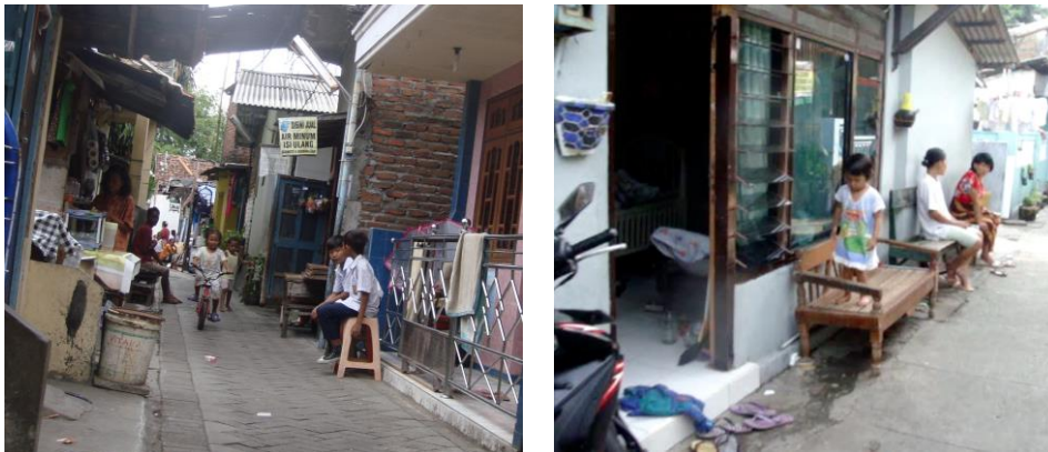
Figure 7. Social spots along the alley.

Another perception (that came up in the interviews): the kampung is perceived as nice place but it is also full of gossipers; peaceful place but traditional way of life. These respondents understood the changing meaning of space in the kampungs over the course of a day. The meanings are carried by the people and their activities. It is the detail that the respondents understood about the space. The physical condition of the kampungs (low, single and semi permanent houses) are seen as traditional characteristic compared to the modern building around them. The contrasting condition with the surrounding creates a feeling of 'thereness', a condition that also Cullen refers to.