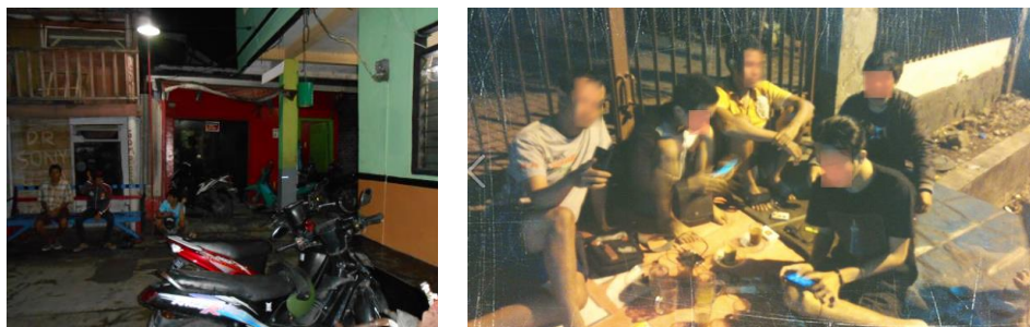
Figure 6. The kampung 's alley for party at one night.

Fewer people are in the alley. The location of socialization is slightly different for the afternoon activities. The kampung 's alley is predominantly occupied by young male adults and men. They gather around the Mosque and the cyber café started from around 8 p.m. The café is open all day (24 h a day/7 d a week) and some customers come from outside the kampung . They are walk or ride their motorbike to the café. The motorbikes are parked in the open space near the Mosque; hence, when the men who are gathered in the open space finish their socializing and go to work (at the Keputran market), the space is full of the café's customers' motorbikes. At night, the kampung is relatively quiet; only the main alley has street lamps, all houses and warungs are closed except the cyber café and its warung. The only people who walk in the alley are the workers with their uniform who just finished their night shift.