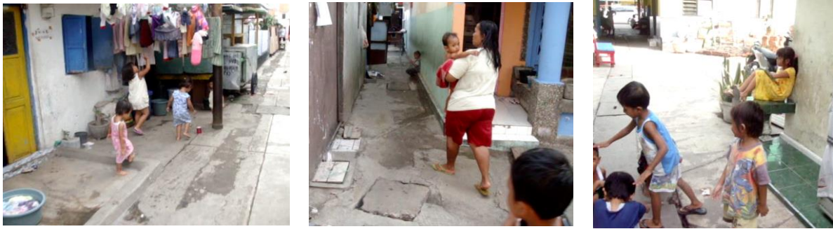
Figure 5. The kampung 's alley at one afternoon.

Around this time, most young adults have just woken up and are having their meals in the warung. They socialize with other kampung dwellers and some are accompanying their little brothers playing around the platform. Women socialize by sitting in front of their house while feeding, bathing their little children or preparing dinner. The mothers are talking to each other and watch their toddlers playing around. Then, the mothers continue combing the children's hair, powdering, and massaging eucalyptus oil on their tummy.