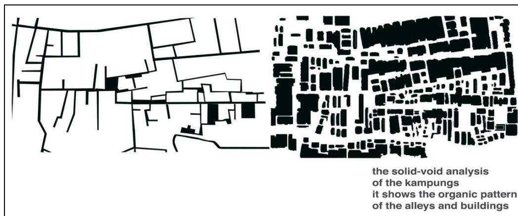
Figure 4. The solid and void analysis of the kampungs .

Through the contemporary perspective, the reading of kampungs is done by observing the social production of space that occurred in the kampungs . This research undertook two analysing methods: observing the daily rhythm of the kampungs and exploring the perception of the young adults of their kampungs .