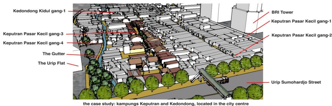
Figure 2. The case study: 1 st to 4 th alley of Keputran Pasar Kecil and Kampung of Kedondong Kidul 1 st alley

The significance of the case study of the kampungs in rethinking Cullen's theory is to fill in the gap of reading kampung through the theory that does not capture what is important in the kampungs ; which is meaning. The theory application partly captures the condition of the kampung , mainly on the visual quality. The kampungs grow organically, it could be seen on the pattern of the alley, how to approach the kampungs and also the size and location of the housing plots in the kampungs (see the picture of solid-void analysis).