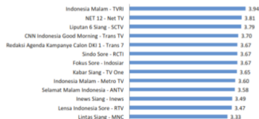
Figure 1 Indonesian Broadcast Commission (KPI)'s report (2016)