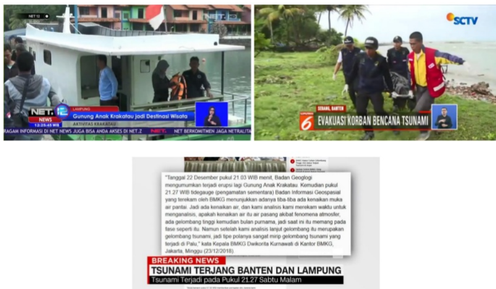
Figure 2 First information that directly connected with disasters

These three videos (figure 2) show information audiences expected, that directly connected with “Banten and Lampung’s Tsunamis” such as what is the main cause of this disaster, how related parties took part in the rescue’s process, and how last condition of the area that effected by disasters.