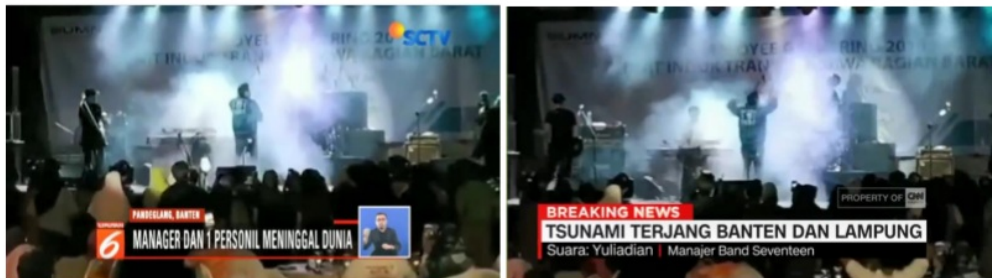
Figure 6 "3 Personel Seventeen Band Hilang saat Tsunami Terjang Banten" – Liputan 6 Siang (SCTV) and "Band Seventeen jadi Korban Tsunami Anyer saat Manggung – CNN Indonesia (Trans TV)

The other news programs still focus on Seventeen Band (figure 6). They used same footage from citizen, in a video recorded by someone standing several yards away, the stage -with the band members on it-briefly floats as the water hits and then is washed away. Band members disappear underwater. People in the audience scream as they try to flee the approaching seawater and music equipment. Then the video abruptly ends.