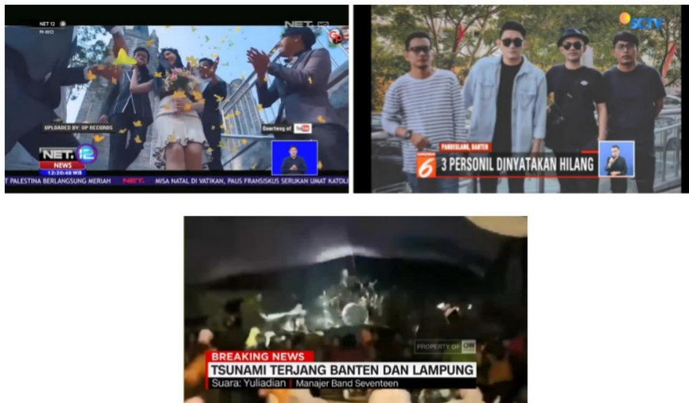
Figure 3 Second information that related with “Seventeen”

While, three other videos, titled “Lagu Seventeen 'Kemarin' Ciptaan Herman Seolah Menjadi Firasat” ( NET 12 ), “3 Personel Seventeen Band Hilang saat Tsunami Terjang Banten” ( Liputan 6 Siang ), and “Band Seventeen jadi Korban Tsunami Anyer saat Manggung” ( Trans TV ). These news videos (figure 3) show another information audiences expected from different of view. They focused on information that related with “Seventeen”, Indonesian Pop Band, who’s their three personnel become victim of this tragedy.