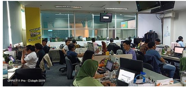
Figure 4 : Work atmosphere in the newsroom of Pasangmata.com, December 9, 2019 (Before the Covid-19 pandemic).

Since March 2020, when the Covid-19 pandemic affected Indonesia, the Pasangmata.detik.com newsroom has been given a dividing glass.