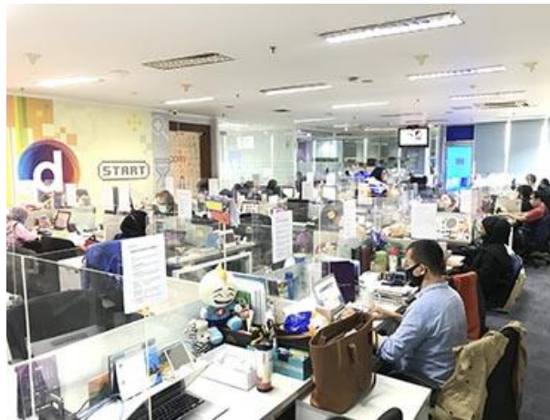
Figure 6 : Pasangmata.detik. com newsroom with dividing glass, July 28, 2020.

Since March 2020, when the Covid-19 pandemic affected Indonesia, the Pasangmata.detik.com newsroom has been given a dividing glass.