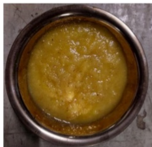
Figure 3. Smashed rejected pineapple that turned into a viscous-liquid substance suitable as binder for briquette

The raw materials for the briquette manufacturing, Pterocarpus indicus leaves and rejected pineapples, were obtained without any substantial cost. Most of them are readily available to be picked as they are considered as wastes. To reduce the moisture content of these materials, they are exposed to sunlight for the duration of a week. After sufficient sunlight exposure, the leaves were shredded into smaller pieces for various particle sizes intended in this study. As for the pineapples, they were smashed to become a viscous-liquid substance, as seen in Figure 3. The smashed rejected pineapples were used as binding agent for the shredded leaves by combining them in a mould and afterward compacted using a hydraulic pressure to become a briquette.