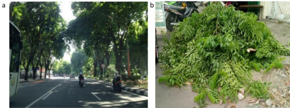
Figure 1. The appearance of a) Pterocarpus indicus trees in a street of Indonesia, and b) their leaves that become litters in the street

While previous investigations [9,13] resolved the main issue of eliminating litters by turning the leaves into briquette, the proposed briquette has a shortcoming; the studies used tapioca flour as a binder for the briquette. Tapioca is an edible resource and therefore the use of it in briquette manufacturing competes with the availability of food resources [14-16]. In the current state of the world where food waste becomes prevalent and some regions suffer from famine [17, 18], the use of food resources to manufacture briquette is highly discouraged. Therefore, in order to preserve the availability of food resources, a substitute for tapioca flour as binder for briquette needs to be investigated.