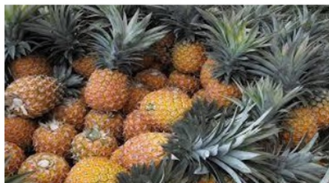
Figure 2. Rejected pineapple that has been left to become mouldy and unsightly to see

The current study aims to discover the effect of changing the binder from tapioca to rejected pineapple and its viability as a renewable source of energy. This study extensively investigated the briquette quality using bomb calorimeter, proximate and ultimate analyses, and combustion characteristic tests. The bomb calorimeter test was performed to determine the change of calorific value from using tapioca to rejected pineapple under various ratio of biomass to binder. The proximate and ultimate analyses were performed to understand to the potential of the briquette to be practically used. The combustion characteristics test was performed to determine the best manufacturing parameters to produce Pterocarpus indicus leaves briquette and rejected pineapple.