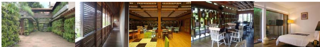
Fig. 6: Documentation of Rumah Turi Hotel

Rumah Turi is a boutique hotel located in the middle of Turisari residents' settlement, Surakarta and occupies area of 1000 m 2 . Rumah Turi built by the principle utilizing what is around it thus the result is an environmental friendly hotel. One example very clearly seemed is the building material choices. Almost all of materials used are used or residual materials, such as paint that use the broken roof-tile that finely pounded then mixed with water and waterproofing and applied on the walls as paint. Temperature regulation conducted by creating the artificial rain in every morning so that the atmosphere became cooler. Waste water processed using infiltration well so that it can be utilized again become flush toilet water, plant watering, and artificial rain. Mosquitoes repellent utilize the natural material such as lemongrass (citronella) to reduce pollution in the room (Soegijanto, 2011).