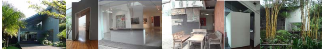
Fig. 5: Documentation of Selasar Sunaryo Art Space

Selasar Sunaryo Art Space located on the Bukit Pakar Timur 100 Dago Atas, Bandung. SSAS stands on an area as wide as less and more 5000 m 2 , where the width used for the construction of art gallery is about 1000 m 2 . SSAS is a design of Baskoro Tedjo who cooperated with Sunaryo, the owner of SSAS to shape the art gallery based on the criteria proposed by Sunaryo, among other: Do not change site by do not demolish the existing area more than as necessary; Reflect the nature and character of Sunda culture; Reflect Sunaryo's characteristic, in other side the functional as art gallery (Ciwendro, 2010).