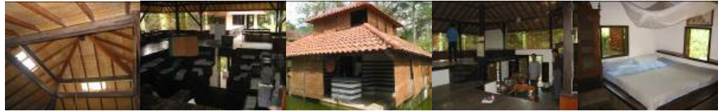
Fig. 2: Documentation of Seloliman Environmental Education Centre

landscape zoning, all take their own parts in environment conservation education. Water and its waste, furtherly processed to be able to divert back to its source, is thrown, and later distributed for the other function. Fresh mountain air is not manipulated, freely roaming, penetrating into the whole corner of the building. Insects are blocked by adding fish ponds circling the building units which also function as panorama and natural lighting reflector.