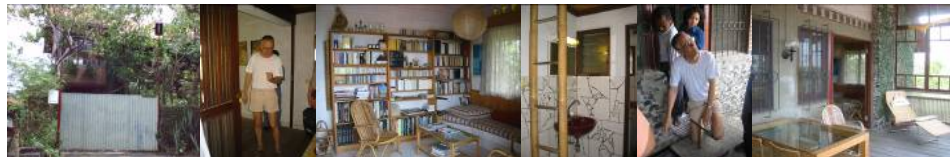
Fig. 1: Documentation of Heinz Frick House

The house of Dr. Heinz Frick is located in the sloping crowded housing area, facing east and south with total average area of 200 sqm. Frick takes advantage of the slope to divide the building into two stories. Room layout is based on ecological house concept, with the applications such as: sedimented rainwater and distributed for bathing, washing, and watering. Further, for the waste water management, a vietnamese septictank is used to terminate E-coli and germs, and the waste water is able to be processed further as soil fertilizer. Frick also planted copper wire under the concrete stripe foundation for the electrical installation. Every socket outlets were connected with three wires and any iron building materials, columns, and concrete reinforcements were coiled to reduce magnetic field. Frick also created his own paint made of tapiocca flour mixed with 5% pine oil to avoid pests and fungi. Lithopon was also used as white pigment paint and the result was remarkably good for tropical humid climate in Semarang. Frick chose to use concrete block masonry wall which needed only 5 liter water on each square meter instead of brick masonry wall which absorbed 65 liter water on each square meter. Sun-facing wall were double-layered by 20-cms thickness natural stones so that the absorbed heat would penetrate into the rooms after 8.5 hours. The advantage is that the rooms will stay cool during the day and during the evening the heat will warm the house.