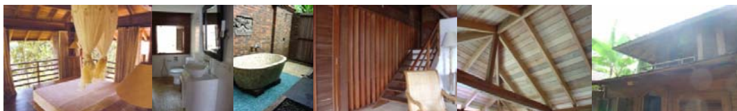
Fig. 4: Documentation of Kaliandra Sejati (Hastinapura)

Kaliandra Sejati located on the foothill slope of Arjuna Mountain, Pasuruan Regency, East Java. Kaliandra Sejati has wide about 16 hectares and designed as the natural and cultural instructional media, particularly Javanese (and Indonesian Archipelago). Kaliandra Sejati consisted of building complexes, one of which is Hastinapura be of 5 masses of 2 stories building and used for staying overnight during the activities. The concern to environment that revealed on the open building design, in the entire of the existing building unit used the natural ventilation. The cooking activities still use firewood, and foods served come from the crops of own plantation. Bathroom also gets openness touch. Building materials choices also applied as the effort that makes it as an environmental conservation. Despite woods domination, but the kinds chosen on their availability in the nature. Bricks materials exposed and arranged in such a way reminding the Majapahit relic temple architecture. The composition of brick by brick as if return the Javanese architecture power. Form, material, landscape, and zoning play its own role in the context of nature and culture conservation education (Hendry, 2008).