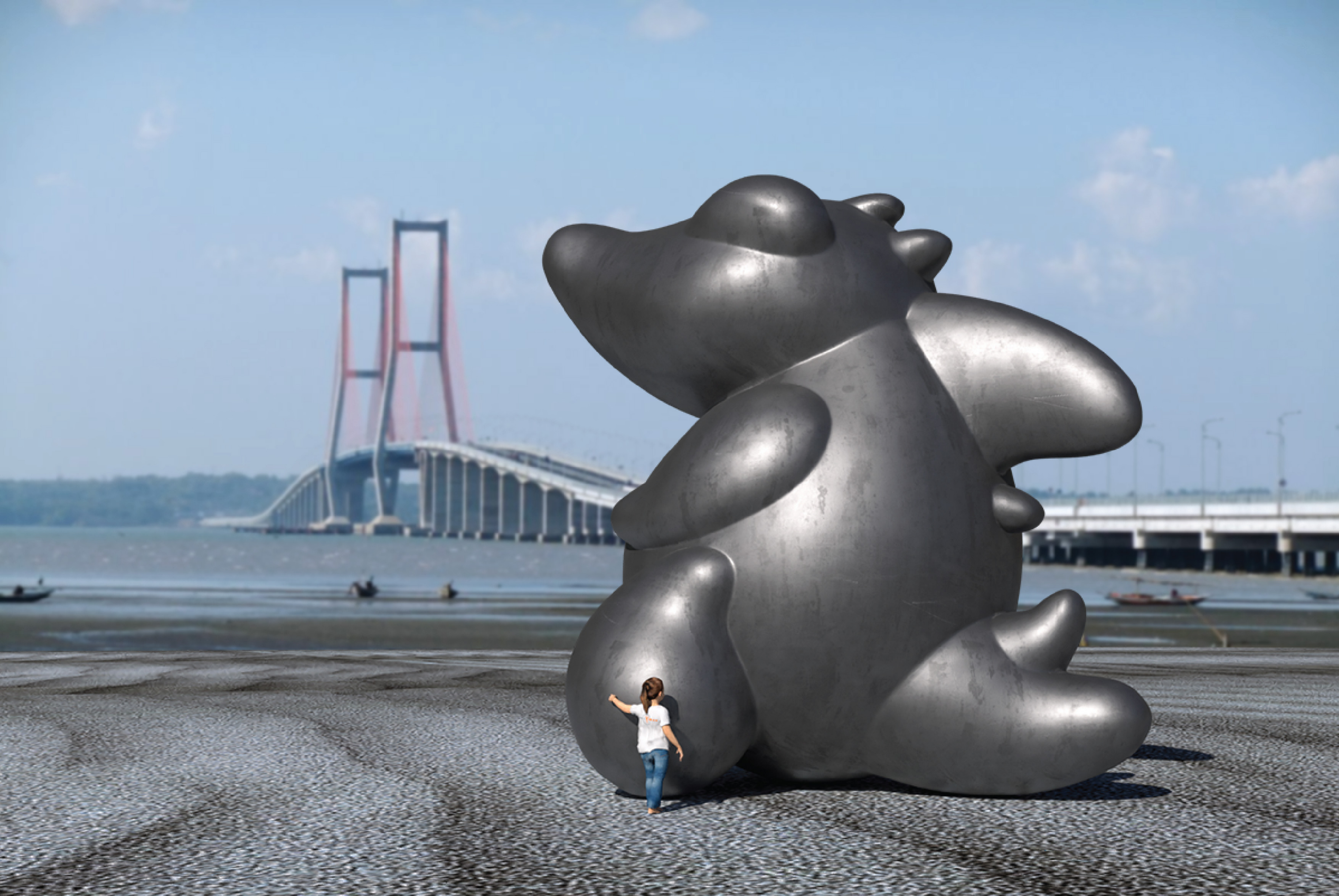
Concept image for Subo Pomelo Steel Sculpture. Suramadu Bridge