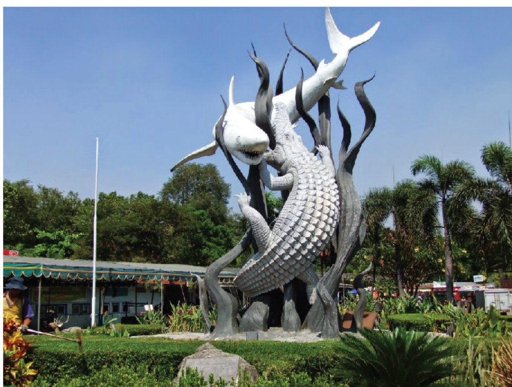
The iconic Suro and Boyo sculpture