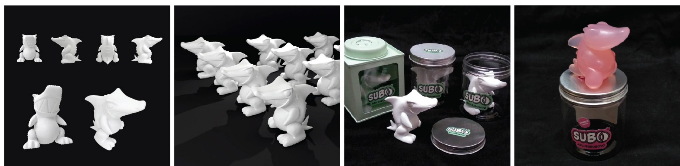
Subo in digital sculpture, production, packaging, logo, and one of the variations, the "Pomelo" version