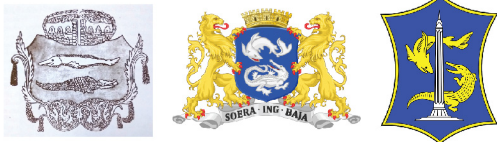
Surabaya city emblem from oldest to present (Widodo, 2008)