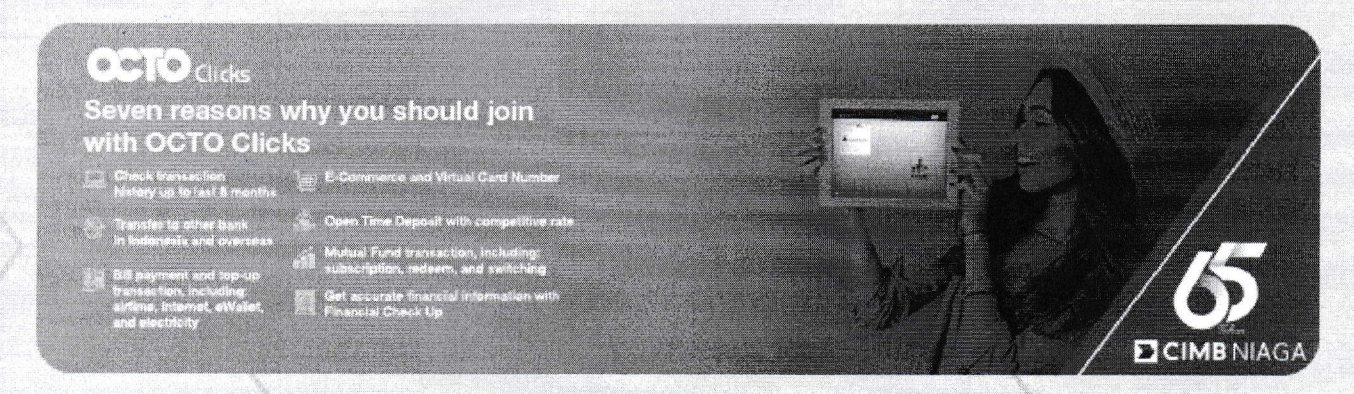
PT Bank CIMB Niaga Tbk terdaftar dan diawasi oleh Otoritas Jasa Keuangan (OJK). Hak Cipta OCTO Clicks © 2020, Hak cipta dilindungi.

Dengan melakukan transaksi ini, Saya menyatakan bahwa transaksi Saya tidak melebihi USD 25.000 bulan ini dan apabila melebihi Saya bersedia untuk memberikan dokumen yang dibutuhkan.