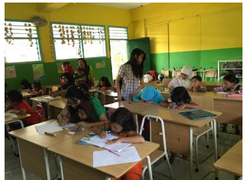
Fig. 12. Our student and the children