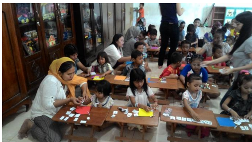
Fig.19. Our student and the children.