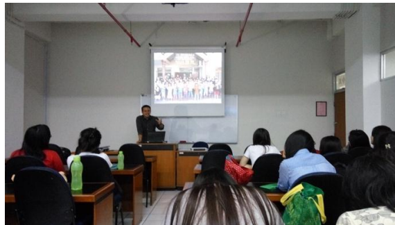
Fig. 3. Briefing from Wahana Visi.