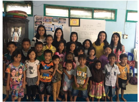
Fig. 10. Our student and the children.