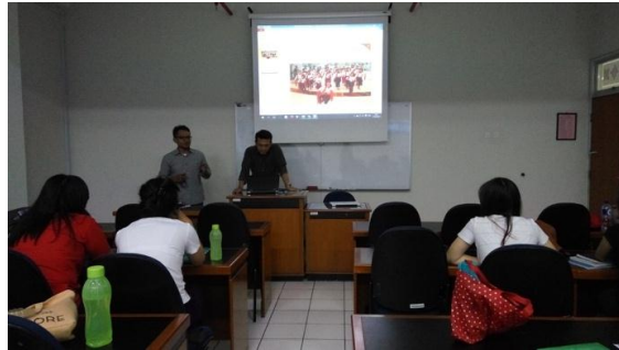
Fig. 2. Introduction about Wahana Visi (World Vision—Indonesia).