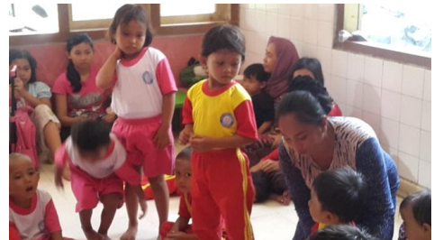
Fig. 8. Our student and the children.