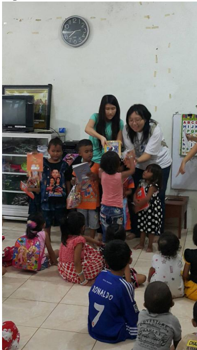
Fig. 17. Our student and the children.