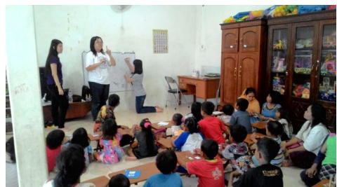
Fig. 20. Our student and the children.