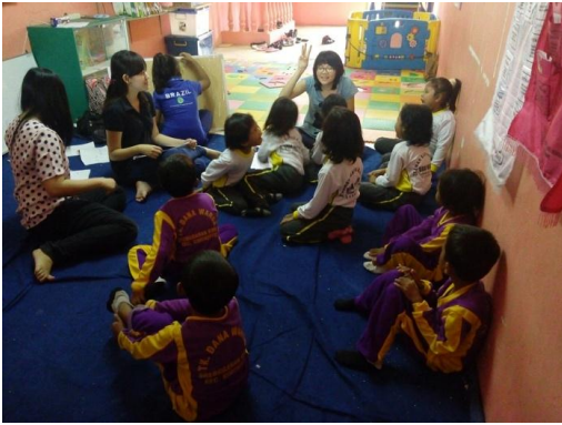
Fig. 9. Our student and the children.