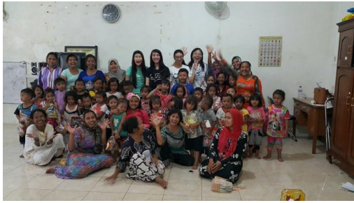
Fig. 15. Our student and the children.