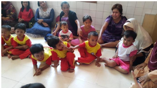
Fig. 7. Our student and the children.