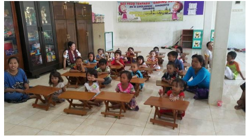
Fig. 16. Our student and the children.