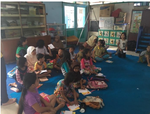
Fig. 11. Our student and the children.