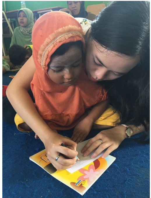
Fig. 18. Our student and the children.