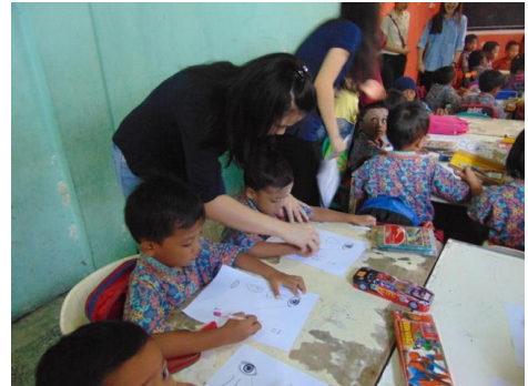
Fig. 6. Our student and the children.