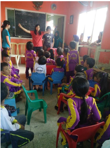
Fig. 13. Our student and the children.