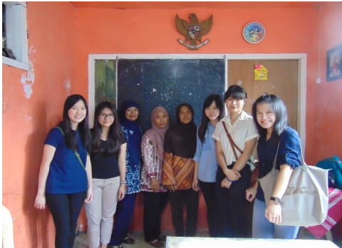
Fig. 5. Student and the group leader.

A primary goal of higher education is to create responsible, moral, and productive citizens. Service-learning programs provide the opportunity for students to explore their understanding of citizenship and responsibility to society. There are many definitions of citizenship, however most of these definitions do not address how to be a citizen in a multicultural or pluralistic society [10]. In the future, we will continue to improve the process of this service-learning and build the association of professional courses and cases. Make the students game to let them more understanding about the origin and development of Simplified Chinese Letter. Some of the documentation of this program's result can be seen on the pictures below (Figure 5 to Figure 20).