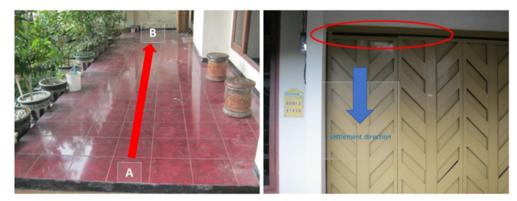
Figure 4. Diffrential settlement.