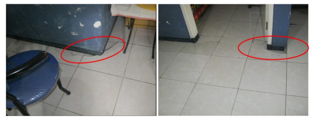
Figure 2. Settlement on living room.

There were some obvious signs of differential settlements, including cracks in the floors and doors are hard to open and close. The cracks in floors were clearly visible in the living room area as shown in Figure 2. From the form of cracks in the ceramic floor, it shows that differential settlement occurred in between the left and right sides of the Case A house. The differential settlement was recorded at 7 cm with water level measurement.