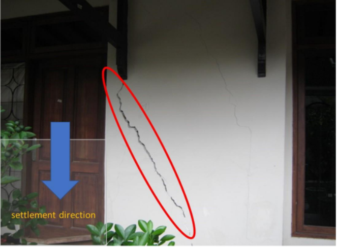
Figure 3. Diagonal crack on wall.