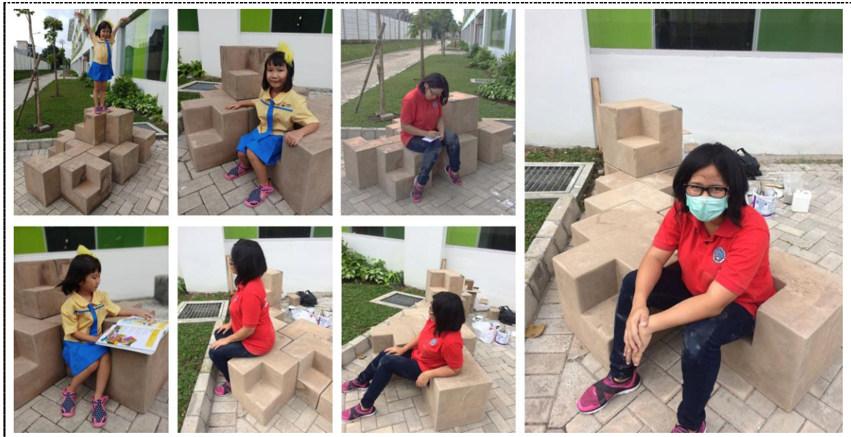
Figure 2. Application of the modular furniture for single occupant activity.

with other materials to produce a lighter weight and stronger product. From the prototypes that have been made, the function of furniture placed in public facilities is tested (Figure 2).