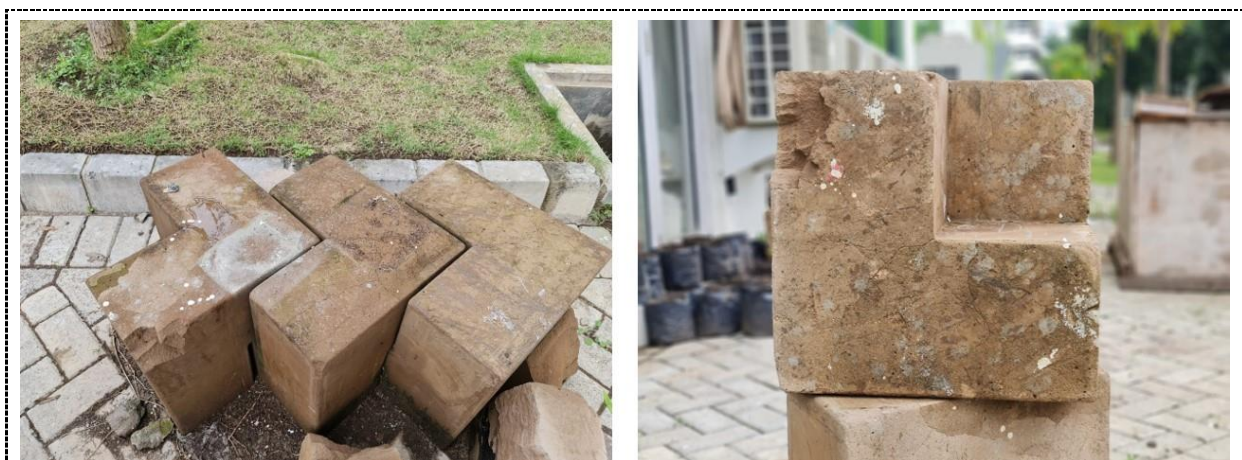
Figure 3. Outdoor exposure of the prototype after two years.

In addition, the corners at each end of the module are still too sharp and may endanger users, especially children. In the initial design, the corner has been made rounder but needs to consider the oblique corners, so it is safe for children. In the development process, sharp corners on the concrete need to be processed again. After the concrete molding process, polishing needs to be done to make each concrete corner and side safer for children. As seen in Figure 3, many prototypes were damaged at the corners regarding the material and weather resistance. Many voids in the CLC material caused a high water infiltration rate. The water infiltration could also cause the concrete to be more brittle and easily damaged. The corner of the product has much brittleness, so it needs to be given a reinforcing structure on the concrete material. The module needs to have internal reinforcing made of wire mesh placed in the internal cavity so that the module is not easily broken off.