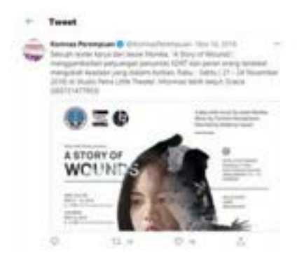
Picture 1. Publication of ASoW by National Commission on Violence Against Women in Twitter.

PLT produced ASoW at three different locations and time and received interesting comments from the audience. ASoW was performed in 2018 and 2019 at Petra Christian University - Surabaya and Sanata Dharma University - Yogyakarta. This production gathers attention and support from many including the National Commission on Violence Against Women (Picture 1).