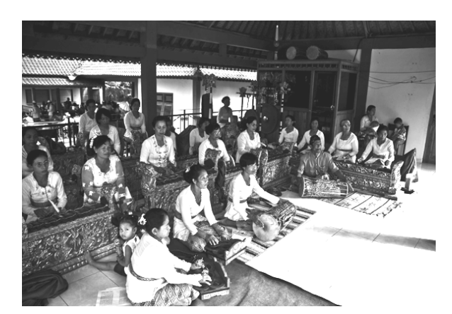
Figure 2. Women playing Balinese gamelan orchestra, commonly played by men. (Gunarso, 2009).

Gunarso followed the method closely for this project. He had a heavy task at hand however, as he had to find many sites of acculturation in Blimbingsari. He had to not only photograph the mixing of symbols and ornamental motifs readily available at the church's exteriors and interiors, but also try to find evidence of acculturation in many other more significant elements of culture. These include rituals, the system of the community, art, language, and the people's behaviors. Such a task would require that the photographer have some background knowledge of both components of the acculturation. Having been born in Bali, Gunarso was quite knowledgeable of the common tradition there. Although a Buddhist, he has lived among Christians during his years in the university. By having this advantage of background knowledge and experience, he was able to sensitively find the images he needed to capture many clues of acculturation surrounding the church life in Blimbingsari without overlooking or taking things for granted. One example in Figure 2 is of mothers playing in the Balinese gamelan orchestra at church for an Easter ceremony. Such a scene would not be found in other Balinese gamelan orchestras because "traditionally" the players are men.