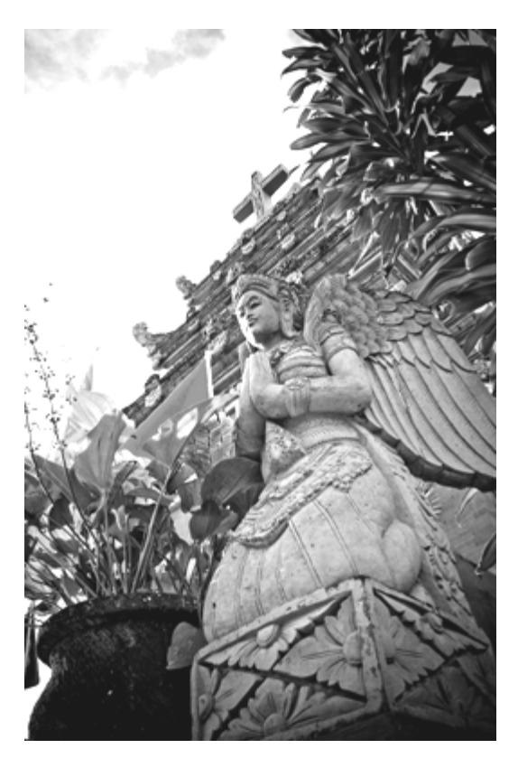
Figure 1. One of Gunarso's photographs showing a representation of an acculturation in a statue of an angel with Balinese dress in front of Blimbingsari's temple-like church (Gunarso, 2009).

dominate their lives, from their arts to their rituals. One anomaly, however, exists in Blimbingsari. All of its citizens are Christian. Although they live a Christian life, they still adopt Balinese tradition in their everyday lives. It creates an acculturation that is unique to Blimbingsari. Gunarso, whose hometown is in Bali, was able to find this interesting phenomenon and wanted to document this piece of Indonesia's cultural heritage and show how it resulted in an interesting mix of cultural symbols. He also wanted to convey how differences can negotiate, adapt, and live together. Part of the aim of this project was to preserve such rare acculturation that has the possibility diminishing in this global era, and to raise awareness of such unique cross-cultural unity.