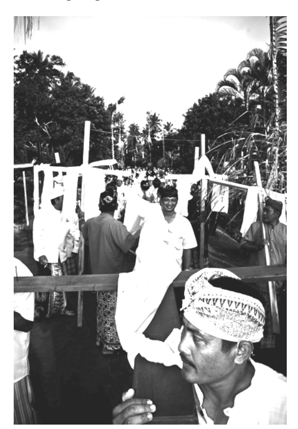
Figure 3. An Easter procession. (Gunarso, 2009).

In the final analysis, Gunarso has demonstrated commendably a rigorous attempt at capturing, selecting, analyzing, and editing the photographs. The documentary photography achieved a balance between technical know-how and cultural sensitivity. However, it produced more of a visual documentation or evidence rather than a narrated story. In order to achieve a more thorough documentary, in this case, time seems to be the essential issue that limited Gunarso. We can conclude from this project several points of consideration and annotation to complement the methodological guideline.