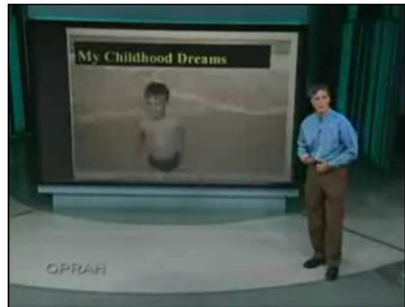
Figure 6. Pausch giving a condensed version of his talk on Oprah.

on his behalf be directed to the Pancreatic Cancer Action Network.