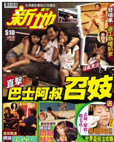
Figure 10. T-shirt with the famous quote sold on the Internet and print media coverage.