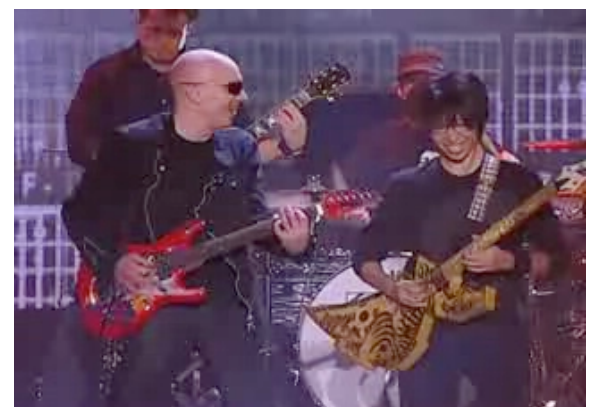
Figure 4. Weezer’s music video “Pork and Beans” showing the iconic bedroom; and funtwo playing in a concert with Joe Satriani.