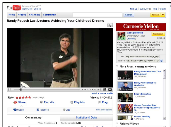
Figure 5. Randy Pausch's Last Lecture: Achieving Your Childhood Dreams