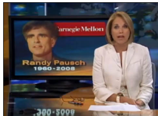
Figure 7. TV coverage after his death on July 25, 2008.

Pausch's talk seems to be directed to the very core of humanity, that is probably why his talk is inspiring to many. Pausch was also a good communicator. His oration skills have been compared regularly to Lincoln, Churchill, and Kennedy. He was a good storyteller. To the worldwide audience, language is not a problem here, because people voluntarily translate and reedit the video with subtitles to their languages. Furthermore, people tend to empathize and also have concerns towards their own health issues and very common sickness such as cancer. A person suffering from such illness but still have such a positive outlook on life and can motivate others usually grabs people's interest and attention. But in short, Pausch emerged unintentionally from obscurity to touch the hearts of millions.