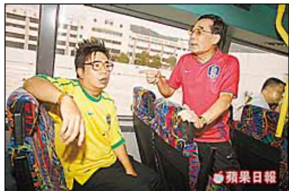
Figure 9. In June 2006, TVB television made a parody of the Bus Uncle video in promoting its coverage of the 2006 FIFA World Cup.

Catchphrases from the Bus Uncle became popular sayings in Hong Kong. The two most used were: "It's not settled!!!" and "I am stressed, you are stressed," and were used on many shows and everyday conversations, especially by teenagers. Chan's famous quotes appeared on Internet forums, posters, radio shows, music videos, parodies, video games, composite pictures, movie posters, TV ads, and mentioned on the main evening news on TVB, as well as Cable TV news. Merchandizes such as cartoon T-shirts with Bus Uncle's picture and sayings, and mobile phone ringtones from the video had also been produced and sold on the Internet. An advertisement for a bottled water company also features a reenactment of the 'Bus Uncle' incident.