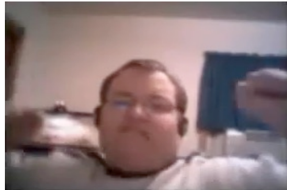
Figure 1. "The Star Wars Kid" and "The Numa Numa Guy." Two early viral web-videos that received head start in popular views before the birth of YouTube.

A professor who focuses on digital ethnography from Kansas State University, Michael Wesch, reminds us also that although our video might be uploaded onto YouTube, it's popularity and spread doesn't always come from just this one site or even just this one video, and not in one specific context, but from many. With the ease of Web 2.0 technology that we have today, it is quite easy to embed videos from YouTube onto your site or blog, and even reedit the video with drag and drop editing software and re-upload it online. And approximately 15% of videos on YouTube are remixes or remakes of other videos (Wesch, 2008). Videos get redone and remixed usually as responses or parodies, especially if they are popular. The popularity and hype of these videos gets the attention of mass media to do coverage on the happening. Thus, creating further popularity for the subjects involved.