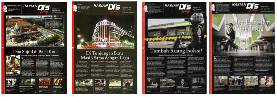
Figure 1. Example of DI's way Daily Cover Design on 4, 5, 22 and 30 July 2020

DI's Way is the latest work initiated by Dahlan Iskan. This print media started from a website where Dahlan Iskan wrote (disway.id). The head office of DI's Way Daily is on Jl. Mayor Mustajab 76, Surabaya. The news from this daily tells a lot about news originating from the City of Heroes. This can be seen from the news in the Main Report section where the general focus is on the situation in Surabaya. This study wants to emphasize the focus of the front page of DI's Way Daily cover design. The designs in the news on this page are the headlines, and spearhead the content of the DI's Way Daily for the day. This research will take information on the DI's Way Daily Cover page in July 2020 which is the month in which this daily was first published. Daily media according to Paxson (2010) has information that is distributed quickly to its readers (p.96). This media has the characteristics of writing news using an inverted pyramid model, where the most important information is at the top.