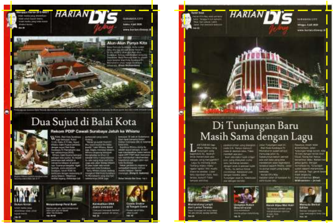
Figure 2. Margin used by DI's Way Daily Cover on 4 and 5 July 2020 (yellow dotted line)

As picture 2 below, you can see the yellow line that surrounds the cover page with a certain size and repeats exactly the same on the two covers of the daily DI's Way. However, for the cover on July 5, 2020, the bottom margin looks like it has been cut off, the contents are very close to the edge of the paper.