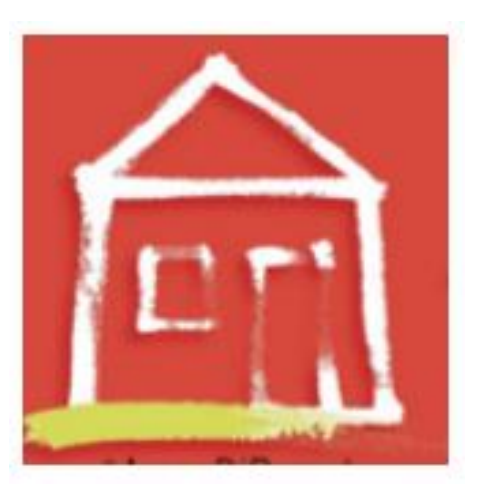
Picture 5. House illustration on Femina magazine front cover Mei-June 2020 edition

In the denotation aspect, the core parts of the house are depicted such as the roofs, door and window. In the connotative aspect, the house seems to be painted by a child. At the age of 6-7 years, children can use paint tools quite well. Children in this period are capable of visualizing common objects roughly accurately. Children of this age are universally able make a picture of an object with a fairly complete organ, even though its shape is still not yet visualized in detail. At this age, the image will generally be expressive, rich and full fill the image area. (Taswadi, 2008, p. 5-6).