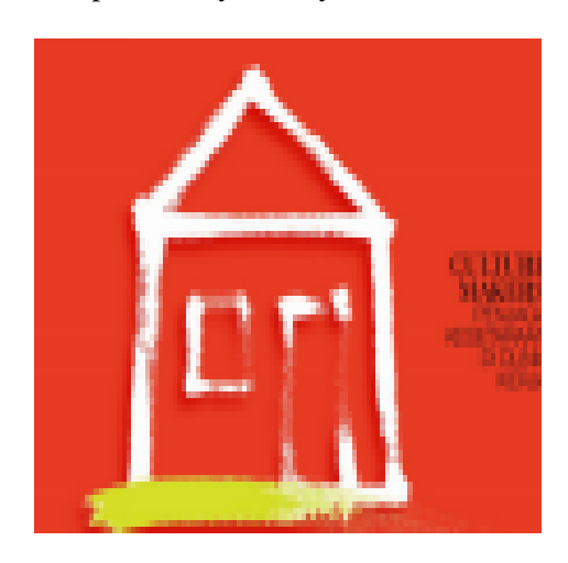
Picture 5. Cover design of Femina May-June 2020 edition

The white house, which is the centre of the reader's interest, asserts the reader to stay at home. Being at home is very crucial and essential during pandemic. Because of the contrast, the message to stay at home is much more powerfully conveyed.