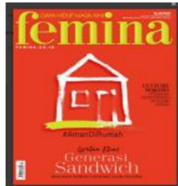
Image 2. Cover design of Femina May-June 2020 edition (source: private documentation)