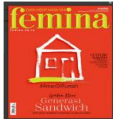
Image 2. Cover design of Femina May-June 2020 edition