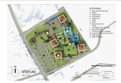
Figure 4. Site Plan (Source: Tjandra, 2017).