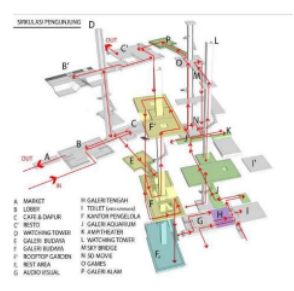
Figure 7. Circulation System of Tourism Centre of Senduro Legend: A. Market; B. Lobby; C. Café and Kitchen; C'. Restaurant; D. Viewing Tower; E. and F. Cultural Gallery; F' Rooftop Garden and Rest Area; G. Audio Visual Gallery; H. Central Gallery; I. Management Office and Toilet; J. Waterscape Gallery; K. Amphi-theatre; L. Viewing Tower; M. Sky Bridge; N. Movie Theatre; O. Games Arena; P. Natural Gallery.