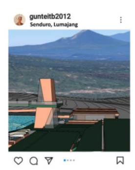
Figure 19. Instagram sample-2 of Bromo-Tengger-Semeru Mountain National Park as design approach of Senduro Tourism Centre.

The digital system can be implemented in The Tourism Centre of Senduro, with digital promotion, where the media is paperless and accessible to people with gadgets, especially for gen Z and Alpha. The tourism centre's design has many instagrammable spaces and can be used as an effective marketing tool on digital platforms. The digital mapping tools or apps can be used to calculate and show the route from the domestic tourist location to the Tourism Center, to show how long they have to travel and what views they can get on the way to the Tourism Centre. This data can affect the tourist's decision, especially domestic tourists, as the sustainability issue tends to become more prominent on tourism choices, as a long-term impact of tourism policies. As the policies to deal with the pandemic are implemented, traveller behaviour can be affected too, always having a safety protocol implemented and using digital platforms to have contactless tourism, as everything is being booked and paid online.