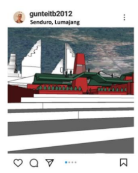
Figure 18. Instagram sample-1 of Bromo-Tengger-Semeru Mountain National Park as design approach of Senduro Tourism Centre.

Cultural\ gallery, an\ Audio\ Visual\ Gallery, and\ a\ Movie\ the atre\ to\ show\ the\ local\ culture.\ The\ Tourism\ Center\ could\ promote\ sustainability\ in\ local\ wisdom\ practices.