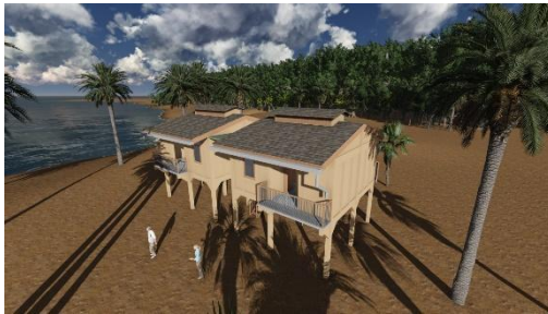
Figure 2. Proposed Fishers' Houses