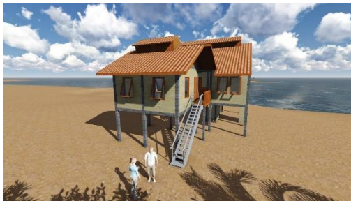
Figure 3. Proposed Tourists Lodges