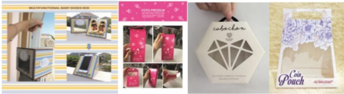
Fig. 2. Four selected packaging design.