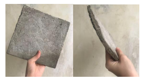
Fig. 7. Sample E

With the same procedure and ratio like sample D, the number of cow dungs and cement material was changed by adding the same binding material, namely cement. The ratio of the new mix was 250 grams of cow dungs, 30 grams of lime, 10 grams of straw arranged on a sack, and 50 grams of cement. The dimension was determined to be 20 \times 20 \text{ cm}^2 and 9 mm thickness. The mix was a bit more and produced a thicker sample than 9 mm, namely 14 mm. Weight variable was also included, and after being weighed the sample turned to be 431 grams (a bit heavier). The result of sample E was the color turned light grey and got hardened. The drying process was also done like the previous sample.