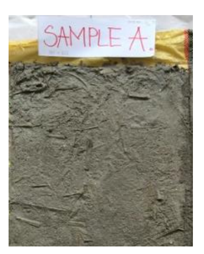
Fig. 3. Sample A

In sample A, we mix 500-gram cow dung, 110gram lime, dried straw cut into \pm 5 -10 cm, and 600-ml water. The procedure is as follows: mix all materials into a casting bucket and stir them with a cement trowel until it creates a dark grey mix. The ratio consists of 70% cow dungs and 30% cement material (lime and straw). The mix is applied to a sack producing a dimension of 30 x 60 cm<sup>2</sup> and 3 mm thickness. The result after it is being dried is the mix gets hardened, turns light grey, and cracks easily. Too much addition of water makes the mix get broken easily. During the drying process in 24 hours, it was raining, and the mix was not exposed to sunlight. Besides, 3 mm thickness that was produced could be categorized as thin.