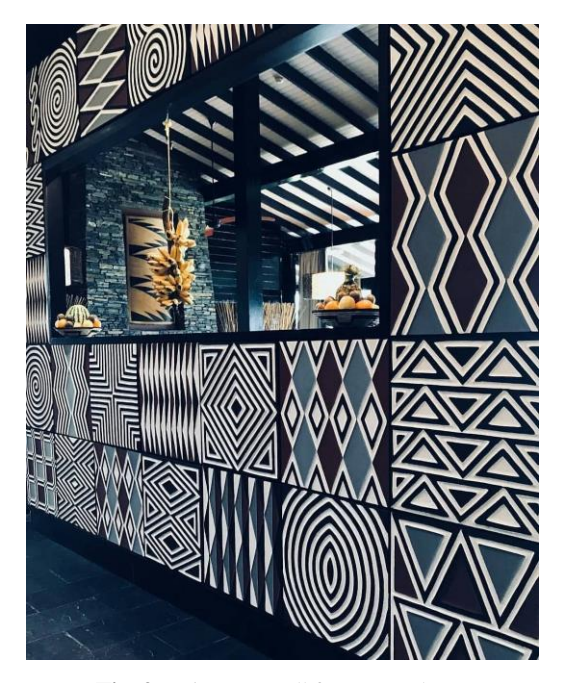
Fig. 2. Imigongo wall from cow dungs

The cow dungs can be used as the material for wall or floor coating. Cow dungs that have been removed from its gas content are mixed with straw and lime, and they are used as adhesive materials and wall coating with the ratio of 70%:30% (Suparma, 2021). Moreover, another benefit from land material and cow dungs for wall is to stabilize the temperature inside the building. On daytime, the temperature inside the house is cool enough, and at night the temperature inside the house is not too cold (Suparma, 2021).