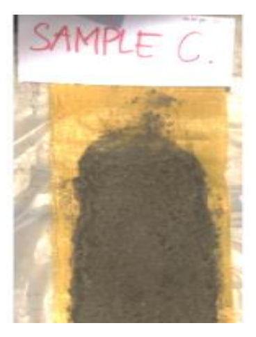
Fig. 5. Sample C

With the same ingredients, the number of cow dungs was reduced into 170 grams, and the cement material and water were also reduced. This is because on the thickness variable it was determined to be 9 mm (regarding the usage of panel or wall partition board that was commonly used according to the reference, namely 9 mm). The procedure of mixing was the same as the previous one, and it produced the dimension of 12 \times 50 cm<sup>2</sup>, and 9-mm thickness. The result showed that the mix was stickier, and because it was thicker than the previous sample, it was more hardened. This was because the amount of water was also reduced.