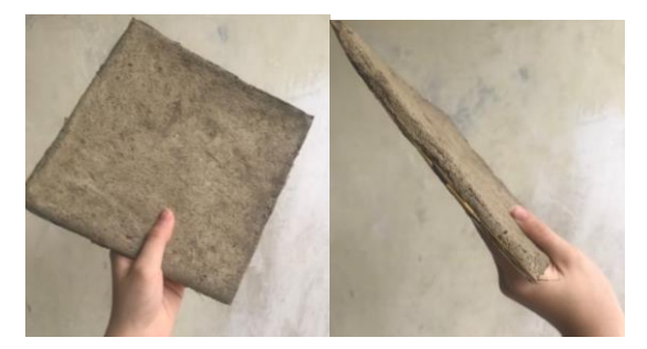
Fig. 8. Sample F

In sample F, the cow dungs were reduced into 200 grams, with the cement material also being reduced according to the initial ratio to avoid leftover mix. White glue of 20 grams as cement material was added. Due to less water than that in the previous sample, the consistency of the mix was a bit solid and dark in color (color of the dominant material, namely cow dungs). With the same procedure of arranging the straw and the drying process with sample E, a brownish grey panel with a dimension of 20 x 20 cm<sup>2</sup> and 9 mm thickness weighing 252 grams (light enough) was produced.