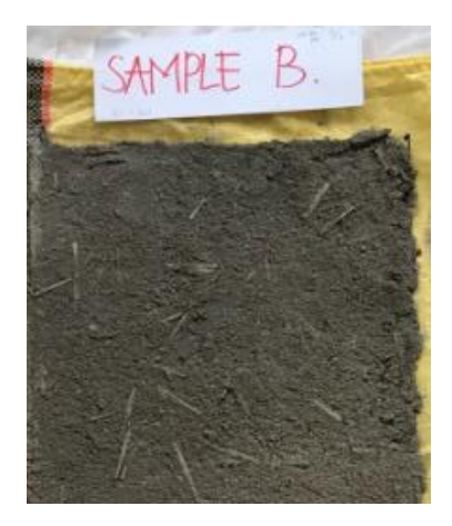
Fig. 4. Sample B