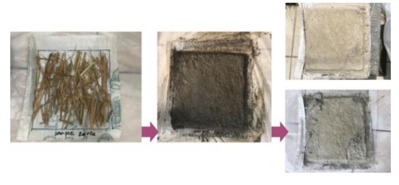
Fig. 6. Sample D

of no more than \pm 10\% as a binding material, so the main material, namely cow dung, became a dominant material while considering the organic material being used. The straw of 15 grams was arranged on top of a sack. The arrangement procedure was done in accordance with clay plaster application (Iskandar, 2016). Next, 200 grams of cow dungs, 30 grams of lime, and 20 grams of cement were mixed into a casting bucket, and 150 ml of water was added. Then, the mix was pressed with any available pressing tool made from balsa wood. This would help the mix to be stickier. The result was the color turned light grey, got dried perfectly, and got easily broken. Water addition was too much so that the initial mix was very liquid, and the back of the sack leaked.