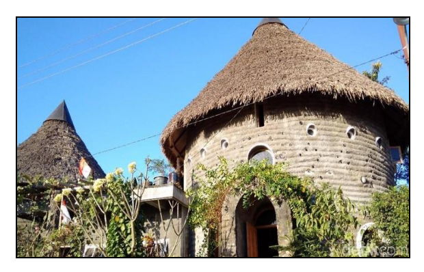
Fig. 1. Earthbag House with wall from cow dungs

a compound which has the characteristics of cement. Cow dung ash is derived from burning the cow dungs. Cow dung ash is a pozzolanic material, and it has silica content of 79.22% (Kumar, 2015). Cow dung ash is produced from cow dung that is dried by the sunlight and burned until it turns dark.