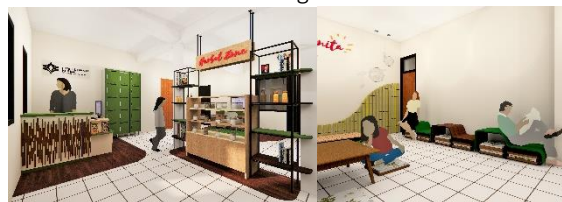
Figure 3. Furniture design visualization (2021)

Furthermore, the design process is carried out with initial sketches, alternative designs to the final design which is visualized with 3D rendering below.