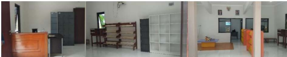
Figure 2. Existing Furniture (2021)

Point of View stage is carried out with analysis of activities and space requirements to ensure that the furniture needs are in accordance with the needs of the object of research. The circulation service area (Figure 1) has a function as a facility for borrowing and returning books, filling in guest books and an administrative area, which requires a work desk for officers. This area is also the lobby of the library. Hence, it needs an attractive design and shows the identity of the Herbal Library. The white shelf (Picture 2) is used as an herb shelf as a concern in educating about herbal. Herbal Library wants to be a place for herbal plant education with a decent and attractive design but also informative. Therefore, we need a unique design. The reading area (Picture 3) does not have seating facilities, both for lesehan children and adults who need chairs. The need for sitting facilities is very important so that communities are interested in studying in a library with comfortable and visually beautiful facilities.