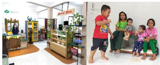
Figure 8. Products placement and testing (2021)

The production process of the circulation desk and herb shelf is carried out in the Petra Christian University wood laboratory with the help of staff (Figure 7). The circulation desk has a function as a work desk and a shelf for children's crafts. On the other side, herb shelf is very useful for the community to learn and educate about herbs. It has another function as a display