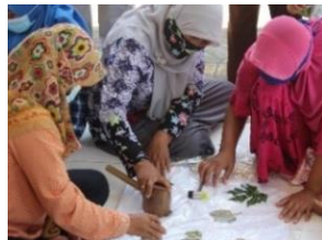
Figure 5. Eco-print training (2021)

In the Prototype stage, collaboration process with designers in the implementation of the design ensured the usability of the design to the community and the society (Thamrin et al. 2018). After finding the design results that have been mutually agreed upon, the production process is also carried out with local communities. Utilizing one of the local materials, namely leaves from herbal plants found around the Herbal Library using the Eco print technique. Eco print is a process of transferring shapes and colors to the fabric through direct contact (Saptutyingsih, E., & Wardani, D. T. K., 2019).