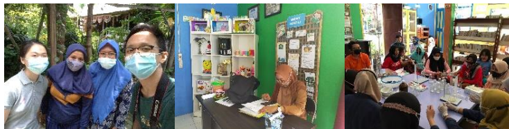
Figure 1. Interviews and Library Activities (2021)

The second stage was the Observe stage, in which the researcher applies the exploratory survey method because the knowledge about the problem to be studied is still shallow. The questions asked in this method are local potential, form of participation, number of participations, and so on. The survey was conducted on April 22-27 2021 with a sample of 54 respondents from Nginden Jangkungan Herbal Village, Surabaya. In addition, researchers also conducted interviews as well as direct observation of the activities of the community and staff at the Herbal Library.