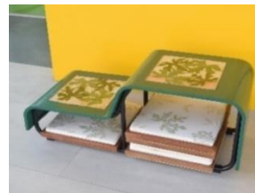
Figure 6. Eco-bench (2021)

Researchers conducted Eco print training (Figure 5) to local community. Raw materials such as papaya leaves, dadap leaves, and neem leaves are easy to obtain and are widely available around the Herbal Library. This activity aims to educate local community in utilizing their wealth of natural resources. Provide insight into activities, which at the same time can provide economic benefits for the community around the Herbal Library. This process proved to be a truly collaborative process of a team work between designers and the community. The result of the Eco-print is used for the pillowcase on the Lesehan seat as a part of the Eco-bench (Figure 6). In addition, the leaves are also used for Eco-bench seat that is given resin so that the design can match the Lesehan seat.