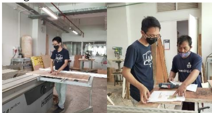
Figure 7. Production process (2021)

Researchers conducted Eco print training (Figure 5) to local community. Raw materials such as papaya leaves, dadap leaves, and neem leaves are easy to obtain and are widely available around the Herbal Library. This activity aims to educate local community in utilizing their wealth of natural resources. Provide insight into activities, which at the same time can provide economic benefits for the community around the Herbal Library. This process proved to be a truly collaborative process of a team work between designers and the community. The result of the Eco-print is used for the pillowcase on the Lesehan seat as a part of the Eco-bench (Figure 6). In addition, the leaves are also used for Eco-bench seat that is given resin so that the design can match the Lesehan seat.