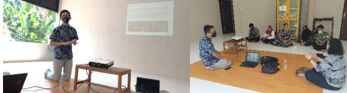
Figure 4. Focus Group Discussion (2021)

(Thamrin, et al., 2020). Circulation desk has recycled wood ornaments in front, showing a natural identity as an Herbal Library. With a build-in herb shelf design, combining wood and iron materials. The design is made as light as possible so as not to give the full impression of the space. Sitting facilities are provided in the form of a bench under which there is a storage area for a Lesehan seat for users who want to sit below. Eco-print application by utilizing leaves from herbal plants that are easily found around the Herbal Library.