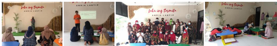
Figure 7. Documentation of the use of the new literacy stage by the community (2021)