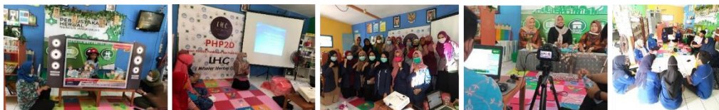
Figure 2. Documentation of activities that have been carried out before (2021)

Based on the framework created, designers and the community discussed to determine the location that would be the implementation area for the new literacy stage (Figure 3). The semi-outdoor area is considered as the strategic area to implement a new literacy stage since it has an adequate area, visible, and accessible by the public who pass the street in front of the library.