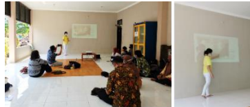
Figure 5. Designers present the results of the 3 alternative designs to the community (2021)

Designers presented the results of the 3 alternative designs to the community for selection and evaluation (Figure 5). Through discussion and consideration, the community chose the second alternative because its simple design represents the character of the community and the environment.