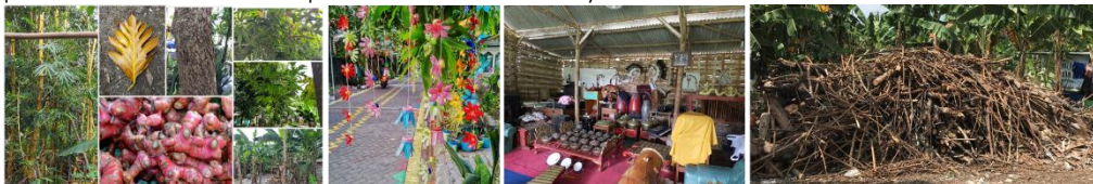
Figure 1. Herbal Library's local identity and potential (2021)

At this stage, several local culture and potentials from the Herbal Library were found (Figure 1). The local community manages the surrounding land by planting herbs, other types of plants, and trees. This effort produces a beautiful garden atmosphere which is identical with leaves, stems, grass and shady green shades. Red ginger is an iconic herbal plant grown by this community. In addition, there are ornamental plants such as yellow bamboo which the characteristic of the library's surrounding. The community also established a waste bank where the collected plastic waste is processed into decorative elements of the surrounding environment. Herbal Library Nginden Jangkungan is located in Surabaya City, East Java. Accordingly the Javanese language is used by the community in their daily communication. The cracker factory in front of the Herbal Library area results in daily deliveries of branches. The branches are used to produce fire for frying the crackers. Those branches become potential materials that represent the local identity.