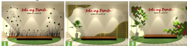
Figure 4. 3 alternative literacy stage designs (2021)

The prototype stage began with the making of 3 alternative designs in the form of 3D rendering visualizations (Figure 4). The first alternative is filled with elements of branches arranged in elongated wooden pots along with leaf shape stickers which are randomly spread on the wall. The second alternative emphasizes bamboo as the main material and a few stems of yellow bamboo, the characteristic of the local surrounding, is applied as accents to make it more visible because the color is different. The last alternative uses panel pieces which are shaped like leaves. The choice of dark green and light green represents the color of the leaves, the brown color represents the wood, and the pink color represents the red ginger. The three alternative designs were made blank in the middle area of the background with red typographic elements in Javanese language "Laku ing Sasmita Amrih Lantip" which means "Knowledge must be sharpened, to make it sharper" (Widyaningrum, n.d.). Wooden color stage, ornamental plants, synthetic grass mats which strengthen the natural atmosphere, chandeliers from the plastic waste, and lighting elements for the modern touch were also added in those three designs.