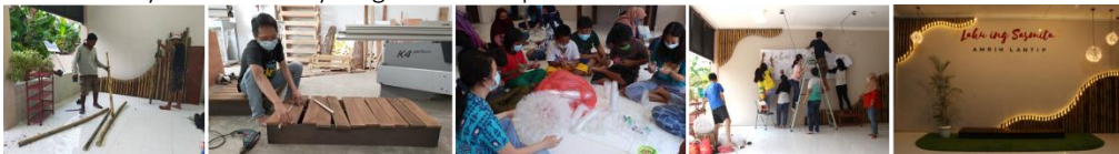
Figure 6. The process of co-implementing with the community and the final result (2021)

Next, the designers together with the community actualized the design that had been selected (Figure 6). During the making of the chandeliers (Yuliani, 2021), the designers taught the children in the Herbal Library community to make those chandeliers by themselves. This collaborative work process creates a transfer of knowledge from the designers to the community and a sense of belonging by the community to maintain the sustainability of the literacy stage is also acquired.