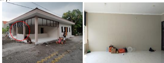
Figure 3. Location of literacy stage design implementation (2021)

Based on the framework created, designers and the community discussed to determine the location that would be the implementation area for the new literacy stage (Figure 3). The semi-outdoor area is considered as the strategic area to implement a new literacy stage since it has an adequate area, visible, and accessible by the public who pass the street in front of the library.