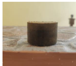
Figure 3. Briquette final product