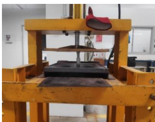
Figure 2. Hydraulic press machine