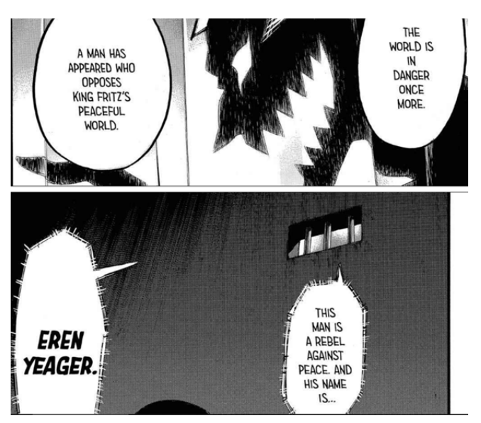
Figure 2.4. The Marleys declare Eren is the enemy.

Sometimes when there is a difference, people see it in negative ways, like a threat. They speculate that different individual or out-group people can likely cause damage or danger later. A threat can trigger an aggressive attitude or behavior toward others, such as dehumanization. According to Maoz & McCauley (2008), although dehumanization and threat provide support for aggressive policies that are somewhat different, they found that people are more likely to dehumanize people who are considered a fairly enormous threat. What Maoz & McCauley explain can be seen in the case of the Eldians. Even though the Eldians feel powerless, they are considered a potential threat to the Marleys and the other nations. It happens because of their ability to become titans. However, The Eldians are not against it because they were brainwashed since childhood by the Marleys that they are an evil nation and have to make up for the sins committed by their ancestors. Another reason is that the Eldians do not have the resources or knowledge about the power of the titans, while Marley has all the knowledge and resources on how to turn the Eldians into titans. So if they have the potential to wield the power of titans, the Eldians will be seen as a threat that needs to be controlled. It becomes the reason to justify Marley's action to dehumanize the Eldians. Here is an example of how the Marleys perceive the Eldians as a threat when they find out about an Eldian who lives in Paradis, Eren Yeager.