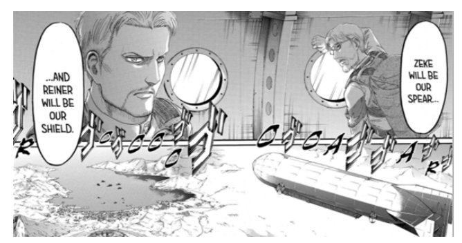
Figure 2.2. Reiner and Zeke, the Eldian who has titan powers, go to war for Marley.

achieve their goals. A person is used by other people because they are considered valuable as an item but if they are no longer useful then they will be considered worthless. The Marleys regard the Eldians as their own, and the Eldians have no subjectivity. So Marley treats the Eldians in a way that is right for them, which depends on the use-value of each individual. The following figure is an example of how the Eldians who have power were only considered tools for the Marleys to go to war: