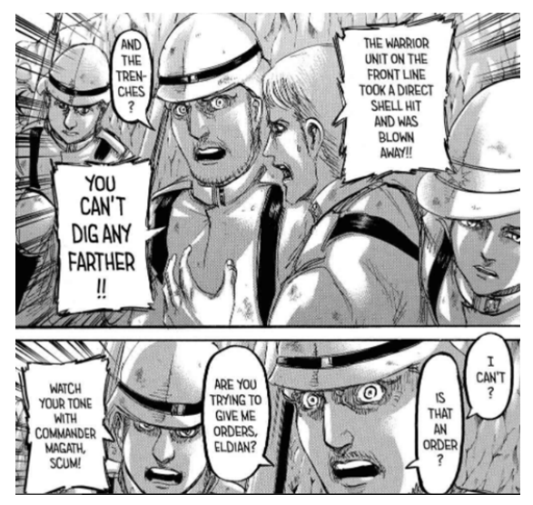
Figure 2.1. The Marleys find The Eldians insolent. Source: Isayama, H. (2009). Shingeki no Kyojin, chapter 91

The first treatment the Eldians experience is that they have no human rights. Everyone has the right to have human rights and also must respect the human rights of others. No matter how powerful or wealthy a person is, everyone has the same human rights, no one has higher or lower human rights. There are various kinds of human rights, for example, personal rights. The kind of personal right that the Eldians are denied is freedom of speech. The Eldians are not allowed to express their opinion freely and must be careful to speak, if they speak carelessly, they will get punished and scolded by the Marleys.