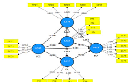
Fig. 2. Path Coefficient Test Results

Based on the results of tests conducted using partial least squares (PLS), the value of the path coefficient of the inner model is demonstrated in Fig. 2 and Table 3.