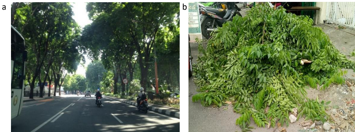
Figure 1. The appearance of a) Pterocarpus indicus trees in a street of Indonesia, and b) their leaves that become litters in the street

While previous investigations [9,13] resolved the main issue of eliminating litters by turning the leaves into briquette, the proposed briquette has a shortcoming; the studies used tapioca flour as a binder for the briquette. Tapioca is an edible resource and therefore the use of it in briquette manufacturing competes with the availability of food resources [14-16]. In the current state of the world where food waste becomes prevalent and some regions suffer from famine [17, 18], the use of food resources to manufacture briquette is highly discouraged. Therefore, in order to preserve the availability of food resources, a substitute for tapioca flour as binder for briquette needs to be investigated.