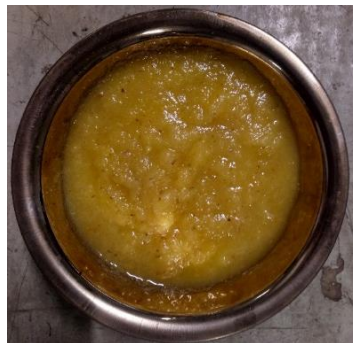
Figure 3. Smashed rejected pineapple that turned into a viscous-liquid substance suitable as binder for briquette

The raw materials for the briquette manufacturing, Pterocarpus indicus leaves and rejected pineapples, were obtained without any substantial cost. Most of them are readily available to be picked as they are considered as wastes. To reduce the moisture content of these materials, they are exposed to sunlight for the duration of a week. After sufficient sunlight exposure, the leaves were shredded into smaller pieces for various particle sizes intended in this study. As for the pineapples, they were smashed to become a viscous-liquid substance, as seen in Figure 3. The smashed rejected pineapples were used as binding agent for the shredded leaves by combining them in a mould and afterward compacted using a hydraulic pressure to become a briquette.