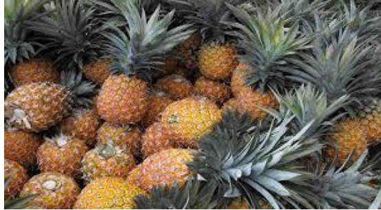
Figure 2. Rejected pineapple that has been left to become mouldy and unsightly to see

The current study aims to discover the effect of changing the binder from tapioca to rejected pineapple and its viability as a renewable source of energy. This study extensively investigated the briquette quality using bomb calorimeter, proximate and ultimate analyses, and combustion characteristic tests. The bomb calorimeter test was performed to determine the change of calorific value from using tapioca to rejected pineapple under various ratio of biomass to binder. The proximate and ultimate analyses were performed to understand to the potential of the briquette to be practically used. The combustion characteristics test was performed to determine the best manufacturing parameters to produce Pterocarpus indicus leaves briquette and rejected pineapple.