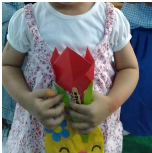
Picture 1 craft activity to make flowers

The third activity was the wrap-up. After telling the story, the teacher asked some questions related to the story that had been told, such as: Who created flowers? What is Meena's pet name? What flowers did Fluffy pass? As Fluffy was running, she saw a flower with thorns. What flower is it? There were two ways of interacting between students and teachers in this stage. Then, it followed by introducing flowers, which were tulips and cherries. The teacher also showed students how to care for plants by applying fertilizer and watering them.