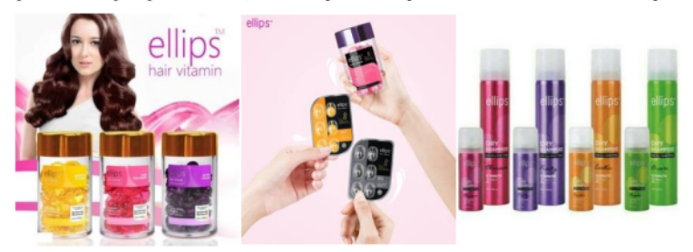
Figure 2 Ellips product

The consumerism that is encouraged by the judge's perspective on beauty standards can be shown through Ellips' encouragement. One of the products endorsed at this event that promotes consumerism is Ellips. The product is a hair vitamin and softener. Two products are highlighted, namely products that are sprayed on the hair and products in the form of hair oil that are applied. One form of endorsement by Ellips is to include its spray product in the challenge. In this challenge, participants must be a TVC model of Ellips products with a horse. With the inclusion of Ellips products in this challenge, the products are always displayed and attached to the contestants. The show of the Ellips products can be seen on Figure 2. This happens repeatedly in one episode of the show, so there is enough repetition to make viewers always remember the product. Because the image is shown repeatedly through an advertisement or promotion process, the idea of the need for the product is implanted in people's mind, and they will buy them to fulfill their lifestyle.