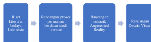
Figure 6. Team's Workflow