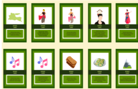
Figure 2. Bonus Cards Design Design