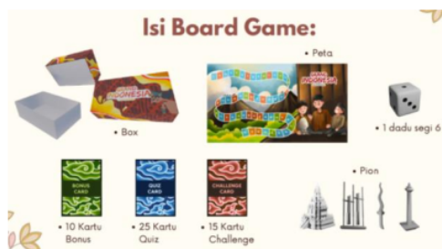
Figure 5. Set of completeness of the boardgame prototype "Grand Indonesia"

To be able to mandate this "Grand Indonesia" board-game, there needs to be a game instruction design so that players can read and understand the process and purpose of this game. The game instructions are as follows: