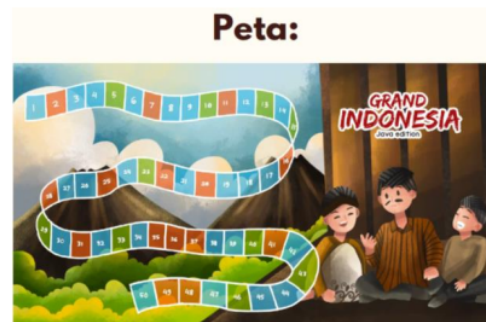
Figure 1. Boardgame Map Design

In the boardgame "Grand Indonesia" there are 3 kinds of cards that are part of the game. These cards become