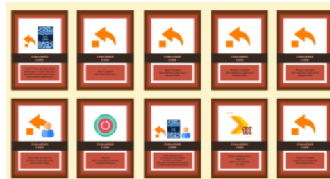
Figure 4. Challenge Card Design

To be able to play this boardgame, players need a set of complete boardgame "Grand Indonesia". For this prototype, researchers and teams have provided the necessary complete design including game maps, cards, gambit sets, dice, and game instructions.