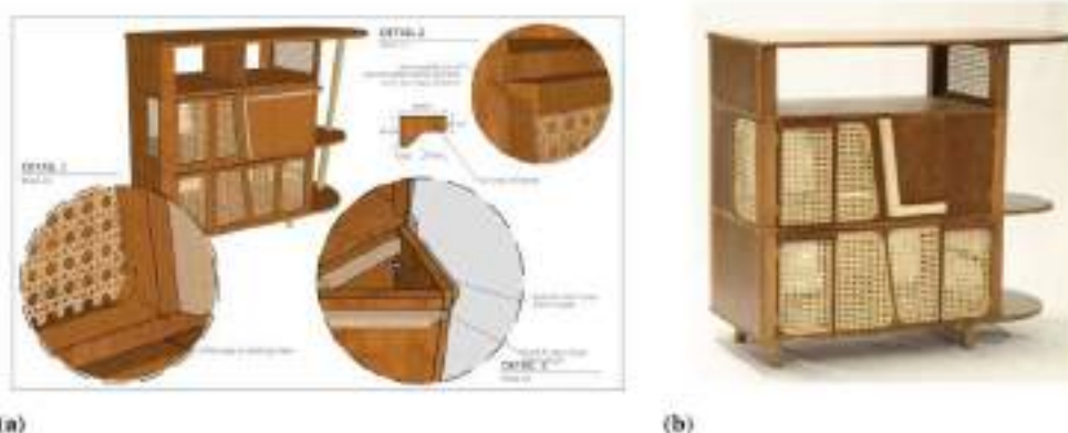
Figure 1. Design of Rattan Storage Rack (a) Detailed picture of the rattan storage rack.; (b) Prototype of Rattan Storage Shelf.

The design uses natural materials, namely wood and rattan. Both local Indonesian materials can withstand and be applied in four-season conditions. The rattan weave is made semi-open, making it easier for users to access the inside of the storage visually. On the other hand, several parts use wood for the door leaves. This is intended to provide privacy for users to store more private belongings. The product applies circular shapes and trapezium-shaped stylization designed by applying the golden ratio of 1:1.6. The visual comfort of the shape, color, and material used underlies the emergence of this design. The shape, according to the golden ratio of 1:1.6 has been widely applied in historical buildings such as Borobudur Temple, Pyramids of Giza, and many more (Meisner, 2018; Thapa & Thapa, 2018). Elements such as round and non-sharp shapes with the right size and ratio are the initial foundation in starting the ideation process or visual design sketches. Using Indonesian natural materials maximizes sustainable local material processing in the export market and provides a different touch in design. In addition, using easy-to-assemble construction such as knockdown will maximize production efficiency and shipping processes.