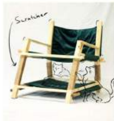
Figure 3. Prototype of Multifunctional Relax Chair

The chair is made of Sungkai wood material, as it has a good and prominent grain. Soft velvet fabric is used for the seat and backrest, making it comfortable. This material was chosen because it has no threaded texture that a pet cat's claws can tear. The product is designed and can be assembled using a knock-down system. This system simplifies the shipping transportation process. In addition, with the limited living space, the product can be easily dismantled when not needed. The flat pack storage system makes the product easy to store (see Figure 3)