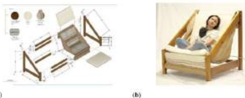
Figure 4. Design of Sisal Relax Chair (a) Detailed picture of Sisal Relax Chair; (b) Prototype of Sisal Relax Chair

accommodate various sitting positions, such as cross-legged and lying down. It is made using local Indonesian materials such as wood, cotton fabric, and ramie rope that are easily recyclable. Despite its large size, it is lightweight and easy to move. The seating system is decorated with ramie rope knots, giving the chair strong resistance against the user's weight. The Sisal Relax Chair has a knock-down concept to facilitate users who like to move their residence. The Home sweet home concept is raised as an application of a house concept that becomes a cocooning facility for its users. The size is made larger, adapted to the dimensions of Europeans, creating a comfortable and warm impression when sitting. Users can freely use this chair in various sitting positions. They can sit cross-legged and raise their feet, making sitting on a relaxing swing comfortable. The main structure uses wood, with soft cotton fabric on the backrest and seat. It is also equipped with Sisal weaving to apply local materials in European design. This facility can be a container for users to watch TV, read books, or even use electronic devices such as phones and tablets (see Figure 4).