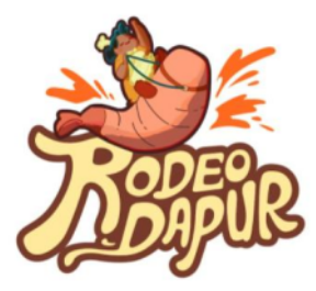
Figure 3. Logo Design

This game is called Rodeo Dapur. The use of the word Rodeo shows an exciting attraction concept. "Dapur" means kitchen which have relation with cooking activities. It is hoped that with this name, the target audience will not feel like they are just reading information about MPASI but that there will be something interesting there.