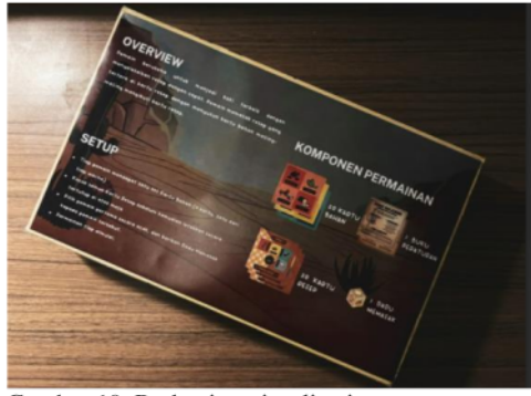
Gambar 10. Packaging visualization