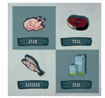
Gambar 4. Blue Design

Ingredient cards are the cards that form the basis of the game where these ingredient cards will be the cards that must be arranged by the players who will later compete to arrange these cards based on the menu cards that appear. Players will compete to quickly arrange the ingredients according to the menu card instructions. The material card consists of 4 basic colors, namely: blue, green, red and yellow. Each of these cards represents a certain ingredient. Blue represents animal protein. Green represents vegetables and fruit. Red represents vegetable protein. Yellow represents carbohydrates. The ingredient card design is the result of discussions and research regarding the need for ingredients for cooking, especially MPASI recipes.