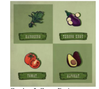
Gambar 5. Green Design