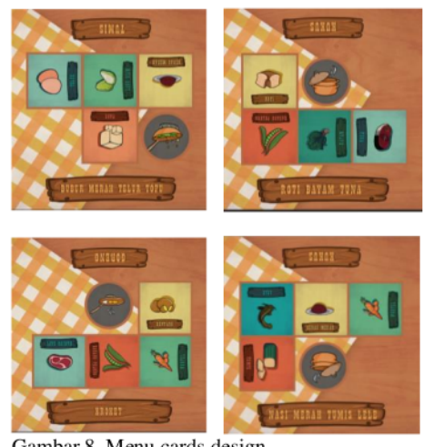
Gambar 8. Menu cards design