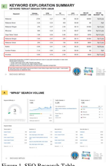
Figure 1. SEO Research Table

The data collection stage was carried out using qualitative methods by holding Focus Group Discussions and quantitatively by collecting Big Data through SEO and Content Pillar analysis. Procurement of the Focus Group Discussion involved DUDI partners as resource persons and 40 students as the committee providing the Focus Group Discussion.