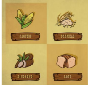
Gambar 7. Yellow Design