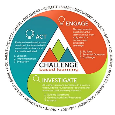
Figure 1. Challenge-based learning

Challenge-Based Learning consists of three interconnected and interflowing main activities, "Engage", "Investigate", and "Act", as shown in Figure 2.1. The idea is that each student must first be engaged with the challenge at hand and explore all aspects surrounding the challenge itself to be able to conduct proper research and collect as much useful information as possible before finally executing their solution plan. These are the main differentiators between CBL and other learning methodologies, in which every idea is naturally explored based on each learner's response to the challenge itself as shown in Figure 1.