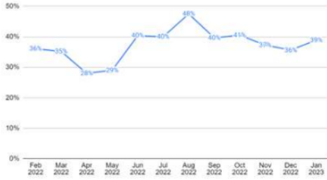
Fig. 3. Percentage of Monthly Vendor Service Usage

These are some of information used in the proposed scheduling method: