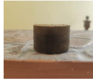
Figure 3. Briquette final product