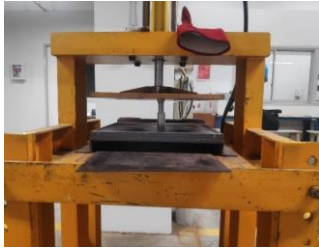
Figure 2. Hydraulic press machine