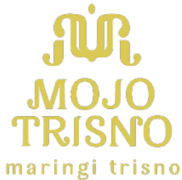
Fig. 4. Mojotrisno Tourism Village logo

Here is the final logo that represents Mojotrisno Village Tourism identity.