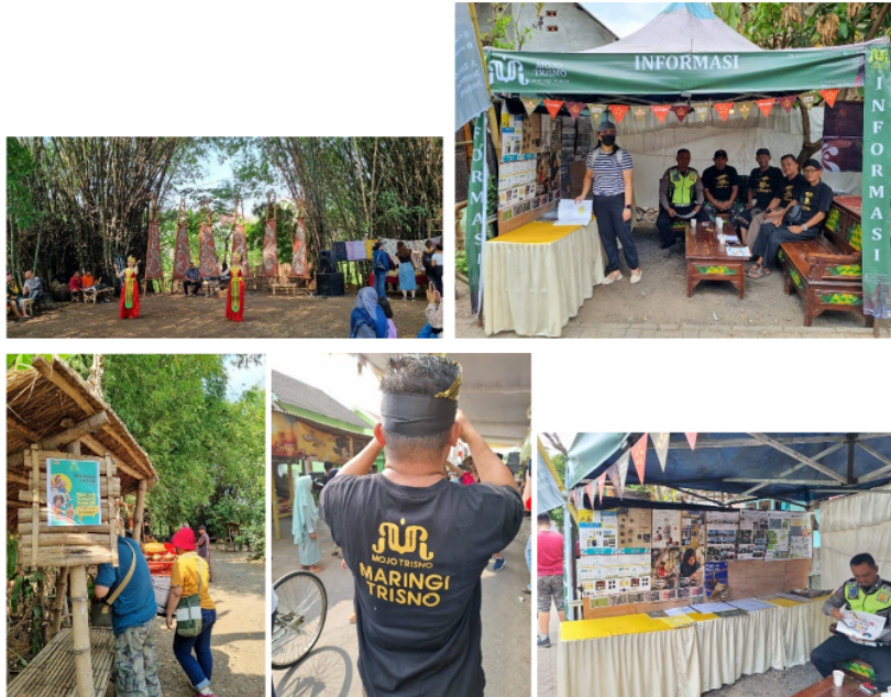
Fig. 1. Mojotrisno Tourism Village branding development progress.