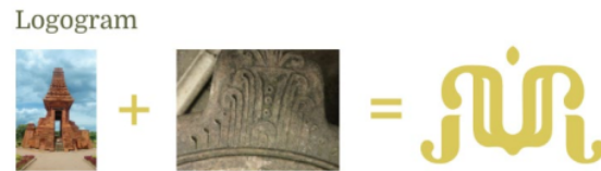
Fig. 2. Mojotrisno Tourism Village logogram

communicate with the audience. To bring the value of this concept, an index approach was made, which can make a sign that has phenomenal attachment between the representamen and its object. Every object that is found in this visual branding, connected with the meaning of Mojotrisno village's social values symbols [7]. Therefore, this logo was made based on below explanation: