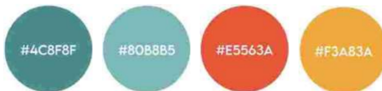
Figure 2. Color Palette of Beras Kencur Cap Obor New Label

From the old label, a new label was made with more attention to design aspects. Where the color selection for the Beras Kencur Cap Obor label uses the colors below which give a retro impression but are still eye catching. The color selection is a bright color in order to attract the attention of potential buyers, especially young people who are easily attracted by bright and cute things.