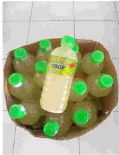
Figure 6. Old Bottle of Beras Kencur Cap Obor