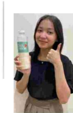
Figure 15. Testimonial from One of the Customer Who Made an Appointment for Cash on Delivery