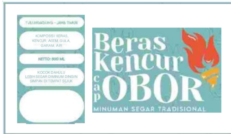
Figure 5. New Label of Beras Kencur Cap Obor

The logotype on the new label is made twisted because it wants to describe the texture of a liquid drink, besides that it also follows the design trends that are popular among young people today. The logo on the new label is also supported by a logogram in the form of a torch image with a blazing fire, describing the Beras Kencur Cap Obor business that has been in production for a long time but is still 'blazing' in the midst of many competitors with the same product.