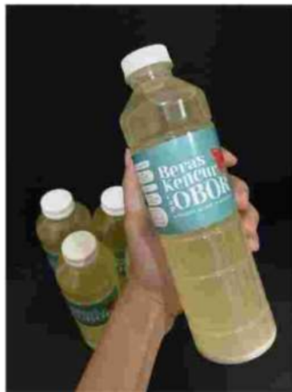
Figure 7. New Bottle of Beras Kencur Cap Obor

For the bottle packaging of Beras Kencur Cap Obor, the researcher has distributed questionnaires to 50 young people in Surabaya and most of them are less interested in buying Beras Kencur Cap Obor with the old packaging because the packaging is less attractive and more confident with other brands because they have better and more reliable packaging and labels. They are more interested in the slimmer and aesthetic shape of the beverage bottle so