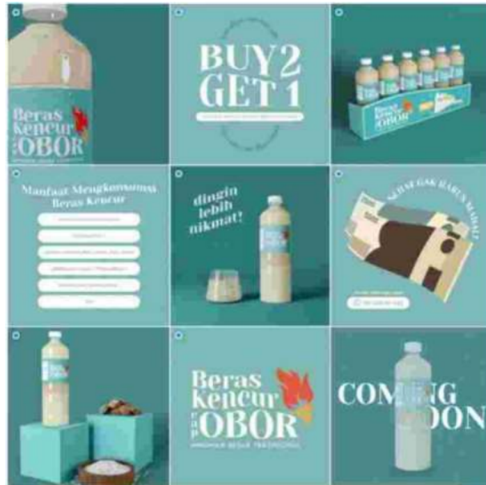
Figure 9. Beras Kencur Cap Obor Instagram Feeds

Cap Obor admin. After that, the product can be sent using delivery services such as Go-send, Grab Express, Paxel, or they can also make an appointment with the admin for cash on delivery.