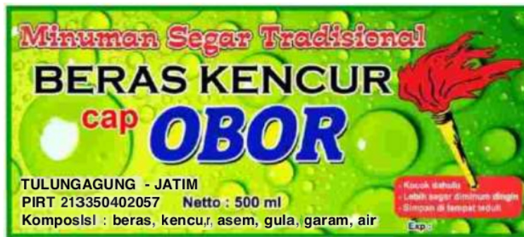
Figure 1. Old Label of Beras Kencur Cap Obor

undergoing considerable changes. So, a more modern label was made using simpler illustration. In addition, the new label also pays attention to the selection of font types so that it looks neat and harmonious.