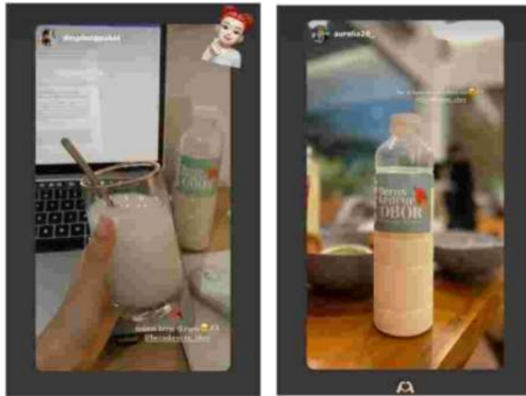
Figure 13, 14. Instagram Testimonial from Customers