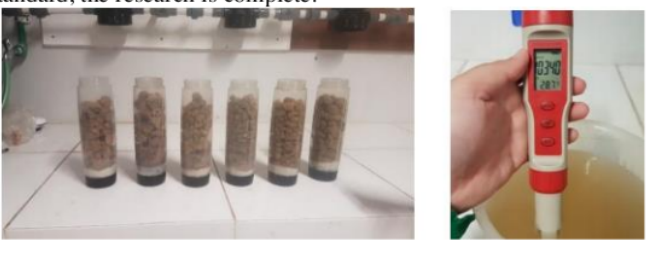
Figure 2. Testing and testing results

Figure 1. Research Method After the sample test results are known, the sample can be tested according to the amount of material to be used (Figure 2. The order of materials that have been tested can be seen in Table 1. The experiment is continued by preparing the material to be tested. This material preparation step is carried out by washing materials such as sand and gravel so that they are clean from dust or dirt. After the material is washed, it is followed by drying the material. After the material is inserted into the filter tube, the filter tube will be installed on a device that has been made with the specified material order. After the filter is installed, brackish water can flow through the filters from the material. After the sample is tested, the test results obtained will be tested (Figure 2). It will be checked whether the results comply with the predetermined standards or not. If the test results are not according to the standard, the experiment will be repeated with a different number of independent variables and if it is according to the standard, the research is complete.