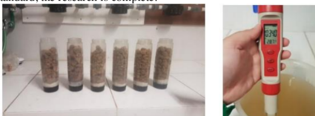
Figure 2. Testing and testing results

After the sample test results are known, the sample can be tested according to the amount of material to be used (Figure 2). The order of materials that have been tested can be seen in Table 1. The experiment is continued by preparing the material to be tested. This material preparation step is carried out by washing materials such as sand and gravel so that they are clean from dust or dirt. After the material is washed, it is followed by drying the material. After the material is inserted into the filter tube, the filter tube will be installed on a device that has been made with the specified material order. After the filter is installed, brackish water can flow through the filters from the material. After the sample is tested, the test results obtained will be tested (Figure 2). It will be checked whether the results comply with the predetermined standards or not. If the test results are not according to the standard, the experiment will be repeated with a different number of independent variables and if it is according to the standard, the research is complete.