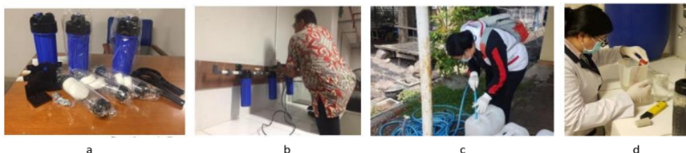
Figure 1. Research Method

The research was conducted in the Petra Christian University water laboratory. The research begins by preparing the tools to be used (Figure 1a). After the necessary tools have been obtained, we can assemble the tools according to the predetermined design as in Figure 1b. With the completion of assembling the tools we can enter the next stage, namely the sampling process in Tegal Sari Hamlet, Kupang Village, Jabon District, Sidoarjo Regency, East Java Province. Water is taken from one of the residents' houses there (Figure 1c). After the sample is obtained, the sample can be tested for pH, TDS, and Ec values (Figure 1d).