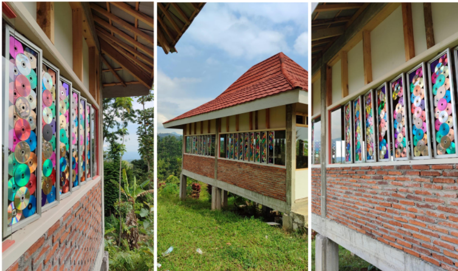
Gambar 3. The application of kinetic facade panel from recycled compact disc in the Tourism Hall - from exterior

As part of the building facade, the compact disc itself can give a beautiful impression to the building itself. The interesting thing besides the use of materials is the location of the building which is in a mountainous area with good wind potential. The Compact disc facade itself is able to react to the wind like a kinetic facade where it moves itself following the wind direction. Not only aesthetic elements on the facade, the use of Compact disc itself has social, flexibility, environmental and economic benefits [5]. In a social way, this facade itself leads to aesthetic aspects while giving a different impression psychologically which gives a pleasant impression to its users. Moreover, in terms of flexibility, this facade is relatively easy to use by using modular and prefabricated systems that are also able to adjust to wind mobility. Then, for the environmental aspect itself, this facade fulfils the natural conditions and also reduces the use of energy in the hall. And finally, economically, the production of the facade is relatively economical, using recycled materials that are relatively common in the area and also using materials that do not damage the environment.