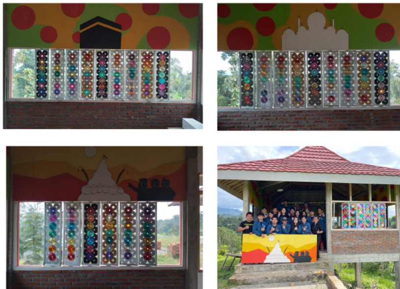
Figure 2. The application of kinetic facade panel from recycled compact disc in the Tourism Hall - from interior

The hall is one of the new tourism centres in the village. With the existence of the hall, it is expected to unite the various differences that exist. In making this hall, besides being built to unite the existing diversity, it is also interesting to use the facade of Compact Disc waste. This round slab of metal or polycarbonate that can store digital data is starting to fall behind due to the rapid development of the times. Compact Discs have become an accumulated waste, this can be seen in the workspaces of Petra Christian University. This Compact Disc itself is made from metal or plastic and has weather-resistant properties[4]. The use of waste in the field of architecture itself can be used as an element to form window panels. By making windows from used Compact Discs, it is hoped that they can be used for building facade needs at a low cost but have good aesthetic value and light and thermal control power.