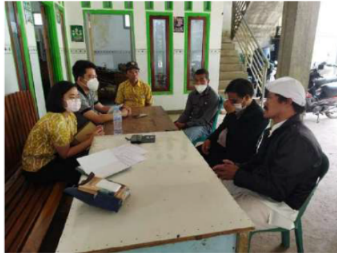
Figure 1. Discussion between the Jarak Village's representatives, religious figures and researchers

The hall is one of the new tourism centres in the village. With the existence of the hall, it is expected to unite the various differences that exist. In making this hall, besides being built to unite the existing diversity, it is also interesting to use the facade of Compact Disc waste. This round slab of metal or polycarbonate that can store digital data is starting to fall behind due to the rapid development of the times. Compact Discs have become an accumulated waste, this can be seen in the workspaces of Petra Christian University. This Compact Disc itself is made from metal or plastic and has weather-resistant properties[4]. The use of waste in the field of architecture itself can be used as an element to form window panels. By making windows from used Compact Discs, it is hoped that they can be used for building facade needs at a low cost but have good aesthetic value and light and thermal control power.