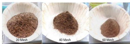
Fig. 1. Sieving results of coffee husk for various particle sizes.

adhesives is compressed on a press machine in a mold to form briquettes. After obtaining the briquettes, each sample was analyzed for various parameters such as high heating value (HHV), proximate and ultimate analyses, coals temperature, ignition time, burning duration, and burning rate.