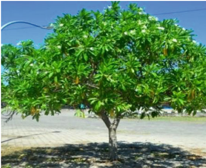
Fig. 14.1 Cerbera manghas tree

The aim of the current study is to determine the impact and feasibility of substituting discarded pineapple for tapioca as a binder for renewable energy sources. This study thoroughly inspects the quality of briquettes using bomb calorimeters, final analysis, and combustion characteristics testing. To measure the change in calorific value with the use of tapioca compared to pineapples sorted with different ratios of biomass and binder, a test using a bomb calorimeter is performed. Calorific value tests and a final analysis of briquettes were conducted to determine their practical usability. Combustion property tests were conducted to determine the ideal production settings for Cerbera manghas leaves from Cerbera manghas tree as shown in Fig. 14.1, briquettes, and pineapple waste as shown in Fig. 14.2.