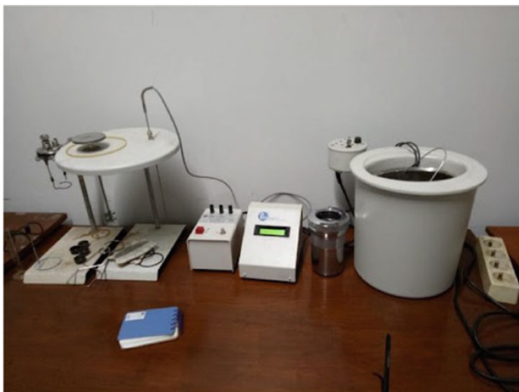
Fig. 14.7 Oxygen bomb calorimeter