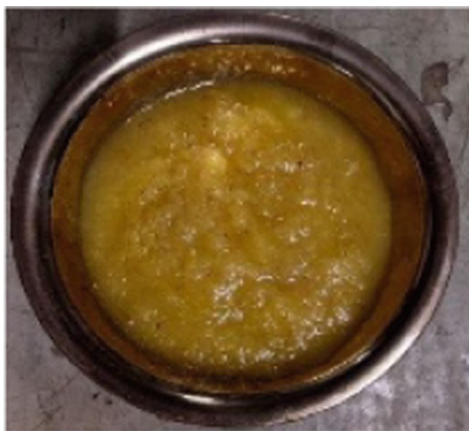
Fig. 14.4 Smashed rejected pineapple