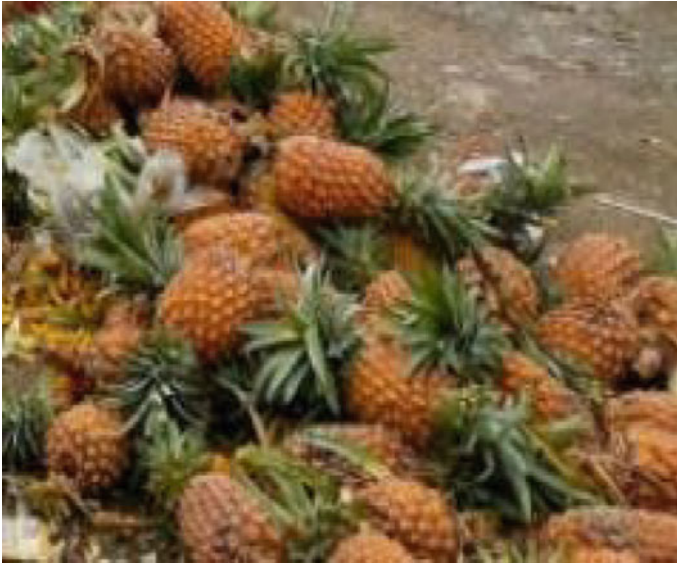
Fig. 14.2 Rejected pineapple