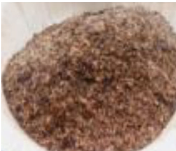
Fig. 14.3 Shredded Cerbera manghas leaves