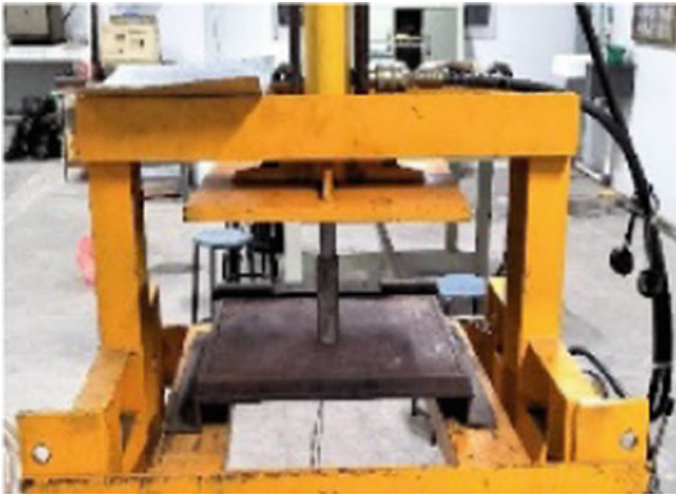
Fig. 14.6 Hydraulic press machine