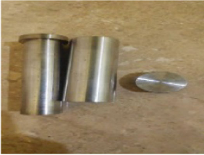
Fig. 14.5 Press mold