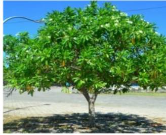
Fig. 1. Cerbera manghas tree

manghas leaves from Cerbera manghas tree as shown in Fig. 1, briquettes, and pineapple waste as shown in Fig. 2.