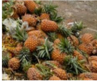
Fig. 2. Rejected pineapple