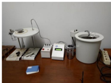
Fig. 7. Oxygen bomb calorimeter

1 combination that produced the best combustion characteristics was determined. The test was repeated three times and the results were averaged and found to be significant. The briquette results can be seen in Fig. 8.