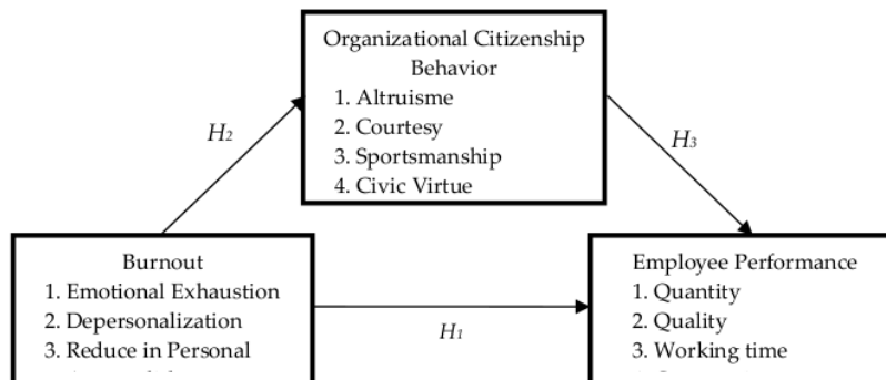
Figure 1. Research framework.

H 3 : Burnout significantly influences employee performance