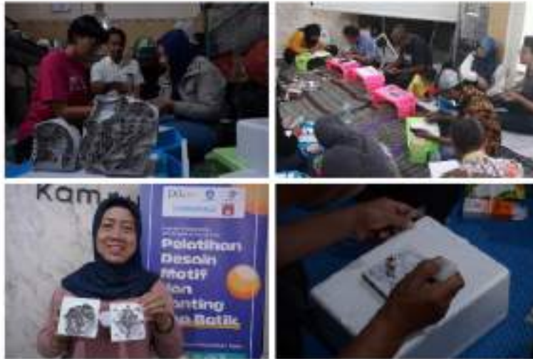
Picture 7. Training activities for making batik canting stamps

participants can now complete 15 pieces of cloth in one week. This means that in one day, they can produce 1 to 2 pieces of batik fabric. The increase in the amount of fabric that can be produced in a short time certainly significantly impacts the volume of batik production in Kampung Dolly.