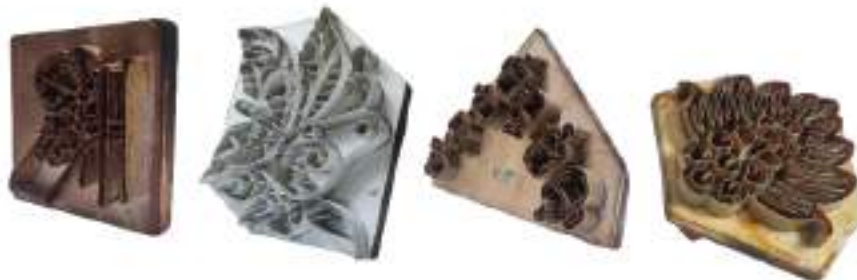
Picture 8. Batik stamp canting successfully made by participants

This success is not just about increasing production volume but also about time and cost efficiency. Canting caps made from recycled materials or waste, such as wood and paper waste, provide a very affordable solution for artisans. Previously, artisans had to spend much money to buy writing canting and other raw materials. However, the participants can create cap stamps with minimal investment by utilizing the wood waste around their residences. This wood waste comes from various furniture businesses around Kampung Dolly, which have a lot of leftover wood that is usually discarded. With the creativity and skills possessed by the participants, the wood waste is processed into functional and durable canting caps.