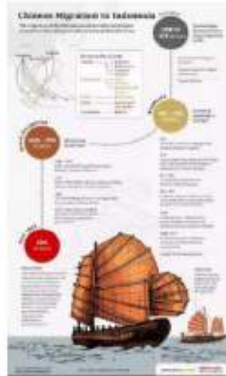
Figure 2. Chinese Migration to Indonesia