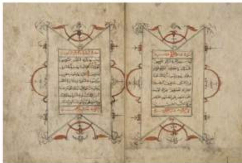
Figure 7. Decorated double frames in red and black ink, at the start of a Qur'an from Java, 18th-early 19th century.