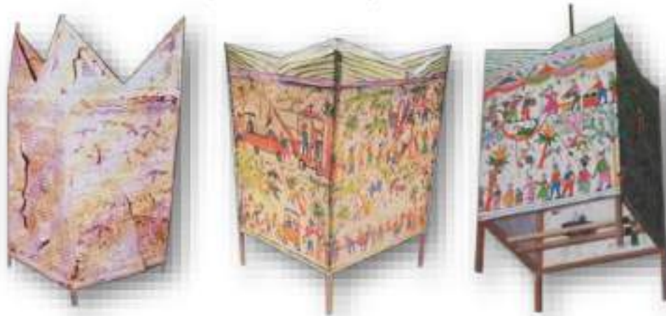
Figure 5. Damar Kurung Lantern