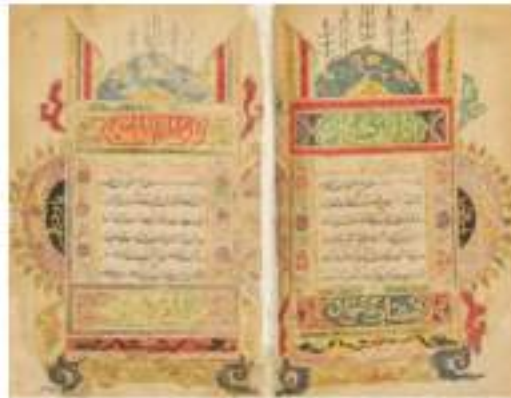
Figure 10. Holy Quran in Islamic Chinese Calligraphy 1138/1725-26 AD