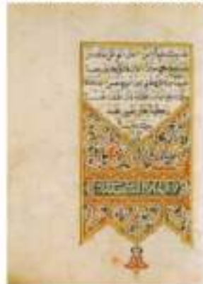
Figure 9. Holy Quran in Islamic Chinese Calligraphy by Ming Dynasty (1368 - 1644).