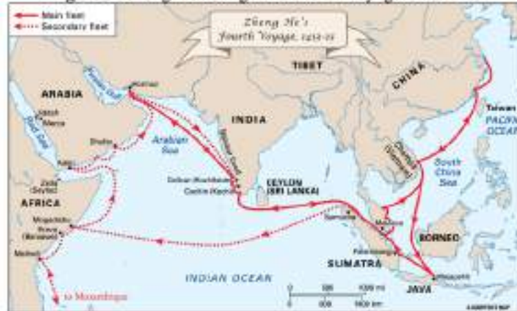
Figure 3. Cheng Ho/Zheng He's Fourth Voyage 1413-1415

(Source: Encyclopædia Britannica, Inc. 2023)