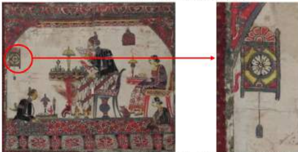
Figure 11. Prince Diponegoro Painting by anonymous Javanese artist