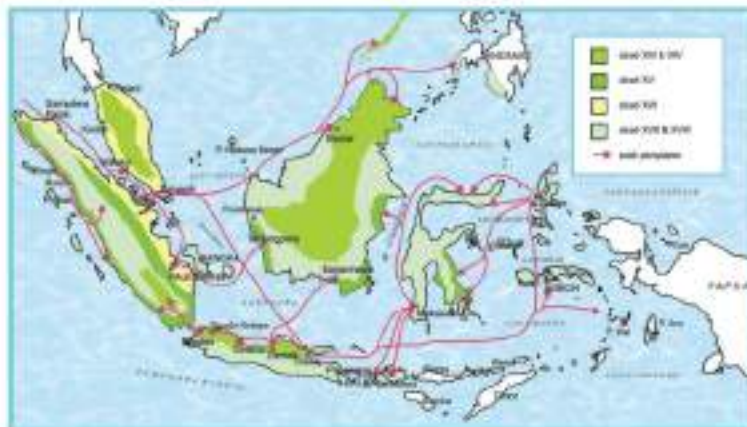
Figure 1. A map of the spread of Islam in Indonesia