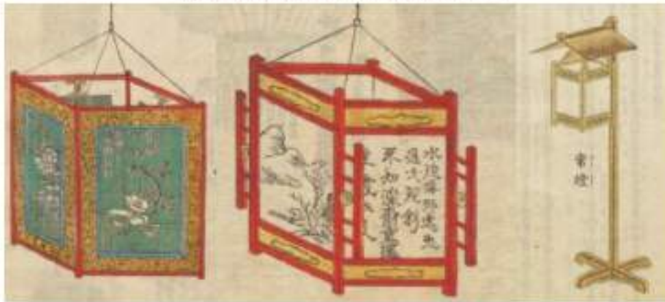
Figure 4. Various ancient lanterns from China