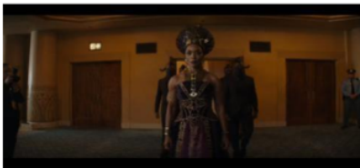
Picture 1. Queen Ramonda enters the United Nation meeting

Data findings in this scene show Queen Ramonda entering the United Nation (UN) meeting which at that time was held in Switzerland. The scene shows Queen Ramonda entering the room to meet representatives of other countries. This scene depicts an intellectual and superior female figure.