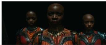
Picture 2. Attack on Wakanda Outreach Center by the military

Researchers found data findings where Queen Ramonda expressed her opinion before the country's representatives, despite the absence of Black Panther, they could still fight the military who tried to steal vibranium. The resistance was carried out by Okoye with Dora Milaje, where they finally managed to bring the attackers from the military to the UN building in Switzerland. This scene depicts a strong and brave female figure.