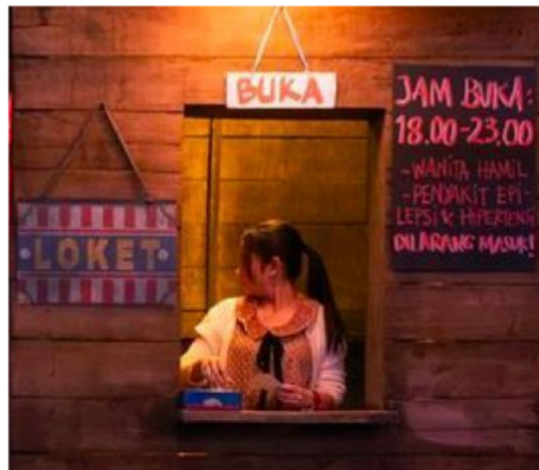
figure 4: Marlina, image of innocent girl in “Agak Laen”

Another example of a different personality shown in “Warkop DKI Reborn: Jangkrik Boss! Part 1”. Nikki and Sophia. Nikki is shown as slut who wears a minimum dress while Sophia portrays a professional with a complete suit similar to a police uniform. Brown color means a color that will give the impression of reliability and strength. The picture below is the comparison of Nikki (left) and Sophia (right) appearance.