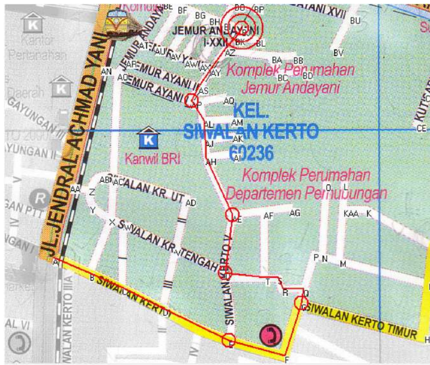
Figure 4: The output of TSP Method

From the test results can be concluded that the route search with heuristic methods can provide results faster but produces a much longer route, whereas when using the TSP method the time required to perform the search requires more time than the heuristic method, but produces a shorter route. However, there is also a condition in which the two methods produce similar results.