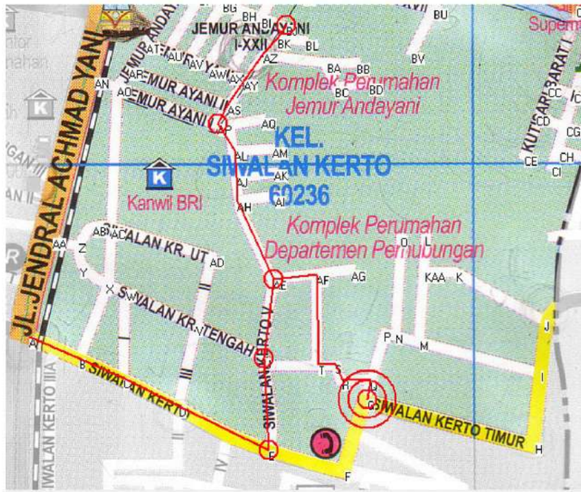
Figure 3: The output of Heuristic Method Testing